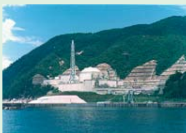
Monju prototype of fast breeder reactor

With growing concern about constraints on the supply and demand of energy and climate change around the world, the CSTP supports R&D that will help to balance environment and economy and at the same time ensure stable energy supplies and contribute to reducing environmental burdens, including energy-saving, renewable energy and nuclear power technologies.