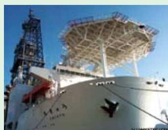
Earth Observation and Ocean Exploration System (Deep Sea Drilling Vessel CHIKYU)

To establish technologies that will enable a full command of the frontiers of the ocean and outer space, and pioneering of the use of these frontiers, the CSTP encourages the development of highly reliable space transport systems, technologies for improving the reliability and functions of satellites, next-generation ocean exploration vessels, and offshore platform technologies.