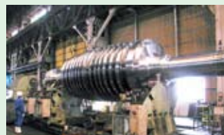
Manufacturing of a turbine shaft (from the business report on MONODZUKURI EXHIBITION)

MONODZUKURI technology is more than just the development of technologies for manufacturing. One of the most important policy challenges is to maximize the added value by reaching the service and information technology industries. Technologies for minimal-resource, energy saving and manufacturing of high-quality products that can withstand the rigors of the consumer market have been the Japan's advantages. By boosting such technological strengths furthermore, the CSTP will seek to make Japan the world leader in MONODZUKURI.