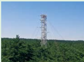
Tower flux observation site measuring CO 2 balances of forest at Mt. Fuji

The CSTP promotes R&D to satisfy both the conservation of the natural environment and economic growth, and to realize sustainable development: R&D related to climate change, hydro-logical cycles and solute transport in watersheds, ecosystem management, chemical risk and safety management. "3R" (reduce, reuse, recycle) technologies, and biomass utilization technologies. Japan would like to contribute to the world through these R&D activities.