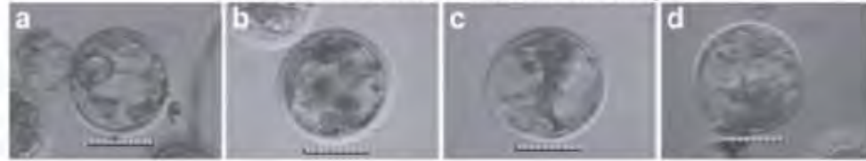
Somatic cell nuclear transfer blastocysts