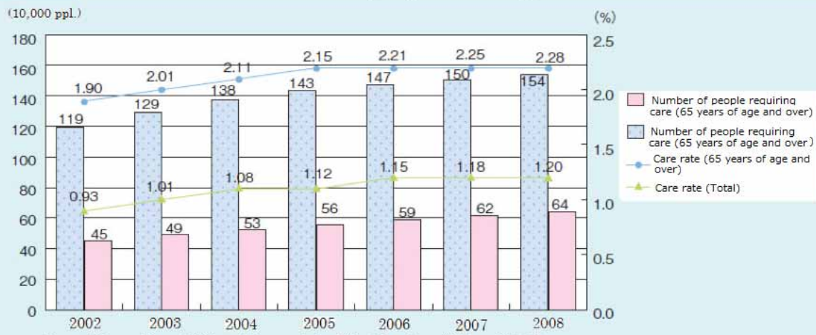
Chart 1-2-2-9 Transition in number of people needing care