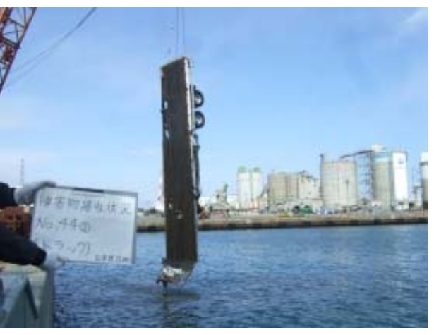
View of the work process to remove an obstacle (trailer) for passage opening (Sendai Shiogama Port, Miyagi Prefecture)

As emergency recovery, in order for the ships transporting emergency supplies to be able to enter ports, Japan Coast Guard, Regional Development Bureau and Port administrators were working on the opening of the passages by removing the obstacles. In the full-scale "Industries restoration. the and logistics reconstruction plan" was formulated in order to