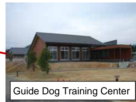
Guide Dog Training Center