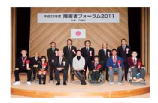
The 2011 Persons with Disabilities Forum