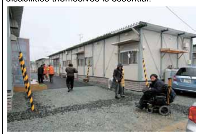
Temporary housing for victims of the Earthquake (Minamisoma City) (This photograph was not used in the report.)

The participation of organizations of and persons with disabilities in devising a plan for reconstruction is necessary. However, the current plan has unfortunately been devised through the participation of representatives from various organizations, without the participation of persons with disabilities themselves or members of organizations of person with disabilities. In future plan development, the participation by organizations of persons with disabilities and persons with disabilities themselves is essential.