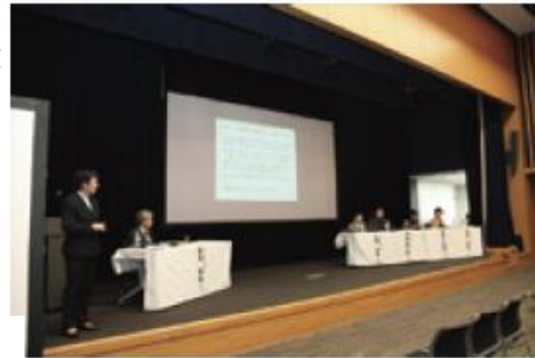
Symposium in commemoration of “Week of Persons with Disabilities” of the year 2016