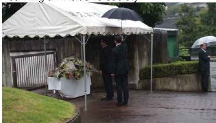
Mr. Kato, Minister of State for Special Missions, visiting the facility and offering flowers (August 29, 2016)

Based on this incident, the Cabinet Office has taken several concrete efforts in 2016 towards realizing an inclusive society.