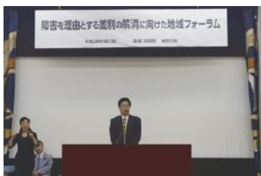
Mr. Kato, Minister of State for Special Missions, addressing the Regional Forum (September 2, 2016)

After this incident, Mr. Katsunobu Kato, Minister of State for Special Missions, attended the regional forum held in Yokohama, Kanagawa (September 2, 2016 (Friday)) and addressed the gathering about the value of life and the importance of realizing an inclusive society.