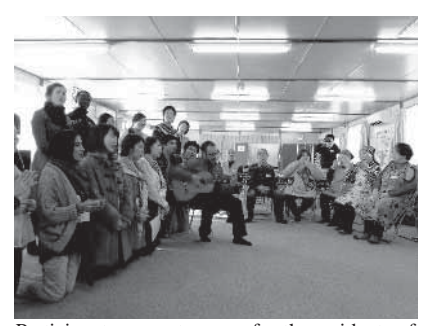
Participants present a song for the residents of a temporary housing complex in Mangoku.