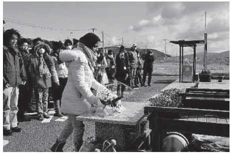
Participating youth representatives pay floral tributes to the memorial site "Ganbaro Ishinomaki" where the largest damage was caused by the Great East Japan Earthquake.

At the same time, the activities were aimed for the young people from eight different countries from the world and Japan to be able to publically express their opinions as to what would be needed for reconstruction through their experience and learning from interacting with the afflicted people. Furthermore, the visit was conducted with the wish to encourage people in the affected area, even a little.