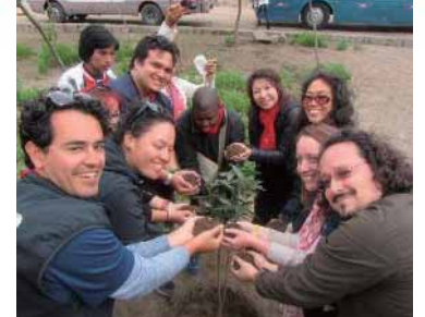
Participants plant trees with a wish for the friendship between the participating countries and Peru.