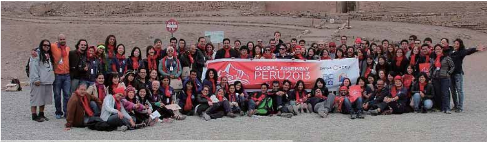
108 participants from 18 country join the Global Assembly.