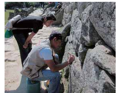
Participants observe the repair work of the Machu Pichu.(Optional Tour)