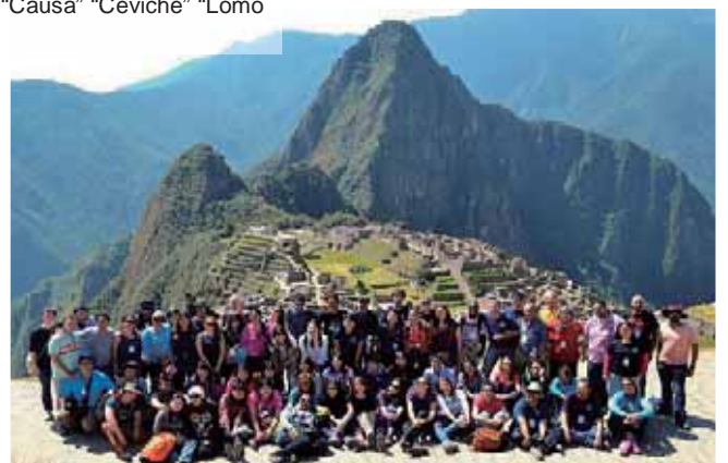
At Machu Picchu (Optional Tour)