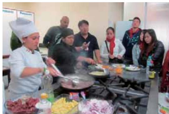
Institutional Visit: Gastronomy, participants visit the first historical market in Lima called Jesus Maria District's market, and then experience the cooking of traditional dishes. The three dishes were "Causa" "Ceviche" "Lomo Saltado".