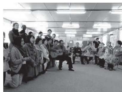
Participants present a song for the residents of a temporary housing complex in Mangoku.