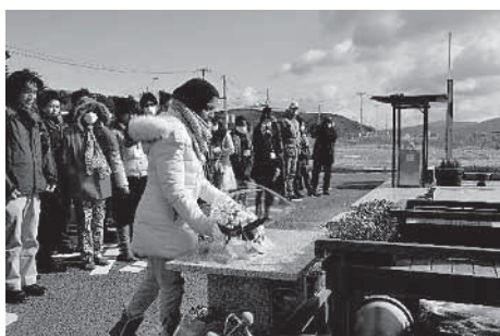
Participating youth representatives pay floral tributes to the memorial site “Ganbaro Ishinomaki” where the largest damage was caused by the Great East Japan Earthquake.

At the same time, the activities were aimed for the young people from eight different countries from the world and Japan to be able to publically express their opinions as to what would be needed for reconstruction through their experience and learning from interacting with the afflicted people. Furthermore, the visit was conducted with the wish to encourage people in the affected area, even a little.