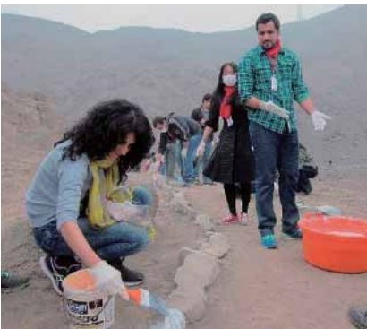
Social Contribution Activity: With the assistance of the organization which promotes conservation of Peru's nature and history, and of which ex-PY is an active member, participants pick up trash around the site and paint stones on the path at the ruins of Huaca Fortaleza de Campoy.