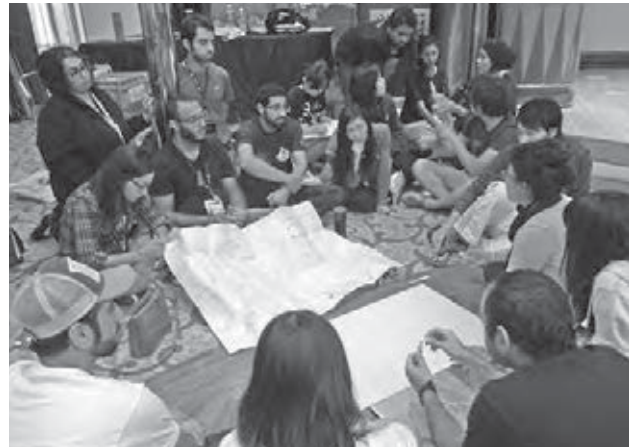
PY discuss about the activity plan after the program