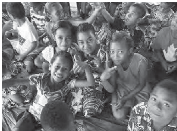
Children of the village

participants listened to the changes in coral reefs and the environment of the island.