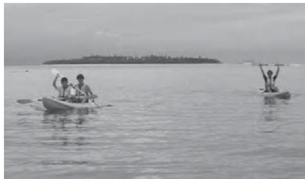
Kayaking around South Sea Island

Through visiting the remote island, the participants were able to experience the beautiful nature of Fiji, and felt the tenderness and hospitality of people living together in nature.