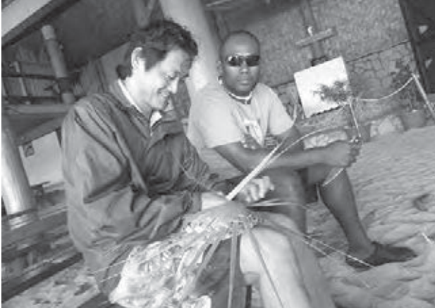
Weaving banana leaves

In the cold rain which had continued on and off from the previous day, some participants took part in an Optional Tour to visit a remote Beachcomber Island by high speedboat. Beachcomber Island Resort where they stayed was a beach resort to enjoy various kinds of activities. After the Official Program, the participants spent a relaxing time there.