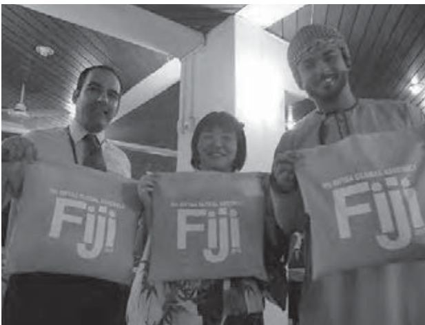
Happy to receive an official bag

These diverse participants rekindled the SWY experience and established new friendships with other batch members and the local youths during this 9th Global Assembly in Fiji. The Global Assembly is with no doubt the