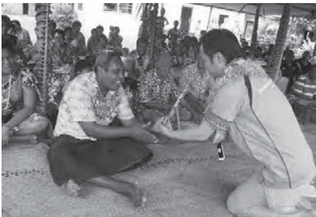
Gift of acknowledgment from Japan

We felt the Fijian style everywhere during this program, which we would not enjoy any other way. One of the most memorable things for me was when we visited a village that had maintained a traditional lifestyle. We were all deeply moved by their hearty welcome. There was an array of dishes on a long table waiting for us. Main dish called 'lovo' was fish and vegetable wrapped in leaves and steamed underground. The village people cooked them for us from three o'clock in the morning. While we were taking food from the table on our plates, many of them encouraged us to try this or that, saying, "This is delicious!" so our plates were quickly piled with various dishes. Every dish was really delicious and elaborate, and we had a wonderful time enjoying the very Fijian home cooking. In addition, their songs and dances were really impressive. They performed as if they were using their entire body as an instrument. Their rich sound and exquisite harmony were so fantastic that I remembered I had also been moved with songs