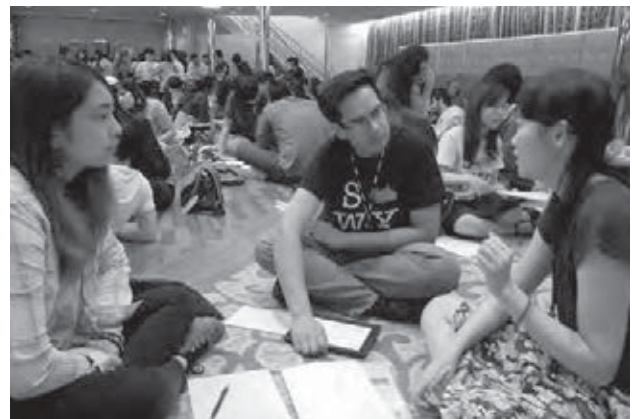
PY share their interest in a small group