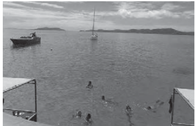
Enjoying the ocean of Fiji

Last but not least, by encountering Fijian committee members' protective tenderness filled with a sense of safety during this GA optional tour, we were extremely grateful.