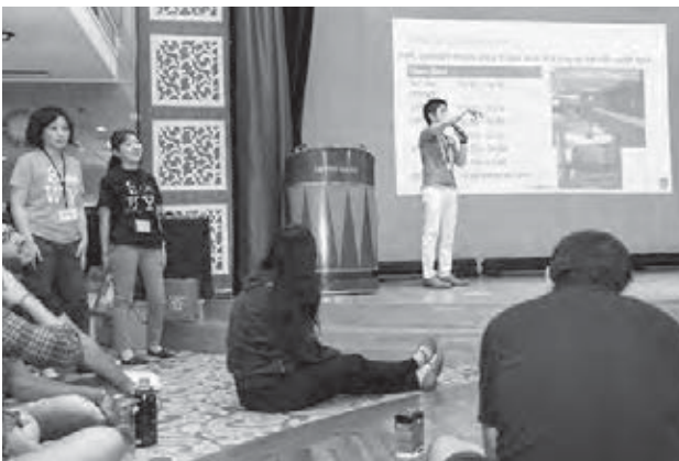
Deliver a message to PY

Taking inspiration from the post program activity sessions, I wish that the participating youths can find their own supporters, and developed as “we can do it together.” Furthermore, I hope to get involved in the projects, as one of the supporters for SWY28 participants.