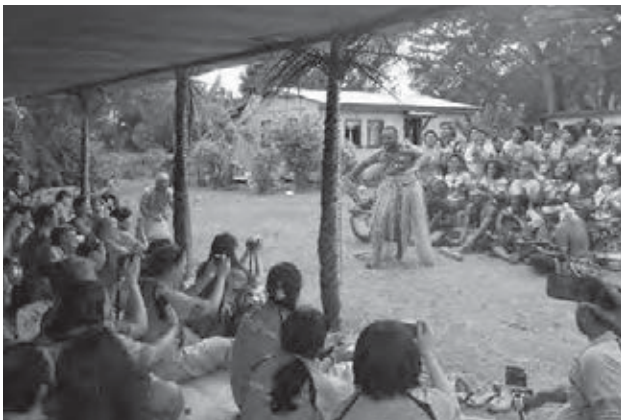
Performance of traditional song and dance

The participants visited one of the villages that Fijian people still had cherished as their own roots, and got a glimpse of their traditional life. It may not be wealthy living, but the way they lived together in the whole community of “village” reminded us the way it was once in Japan.