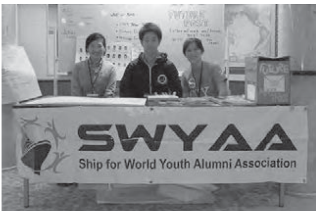
Three Dispatched Representatives