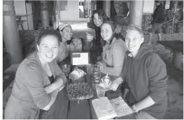
Participants are enjoying the Optional Tour

An overnight party was followed by the wedding, since the following day was August 19, the last day of the tour, the party, which was also a farewell party, became very lively.