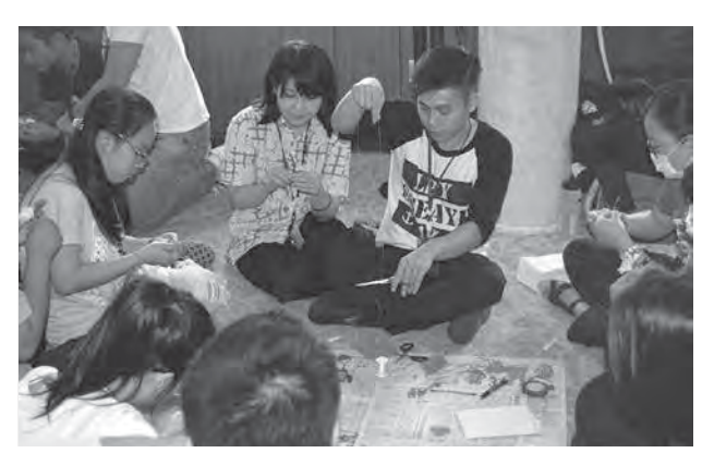
Club Activity (Lao P.D.R.)

Tea ceremony, Okinawa's traditional dance Eisa, Japanese calligraphy