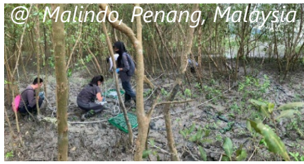
Evaluation of biodegradation of materials developed in the PJ in mangroves