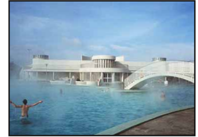
Hot water 1930