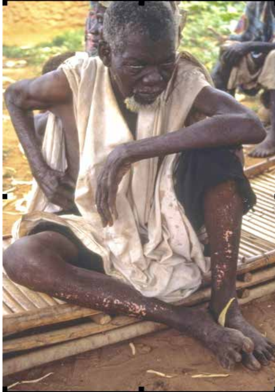
An old man, blinded by onchocerciasis, with leopard skin on his legs and nodules on his