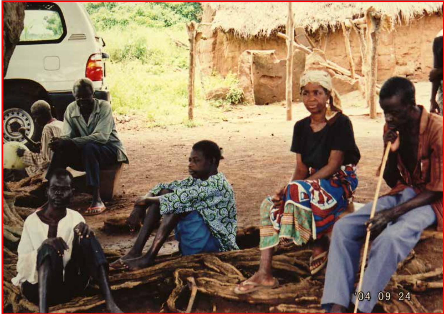
Asubende, Ghana (2004)