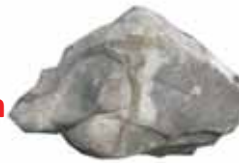
Metal oxide (mineral)