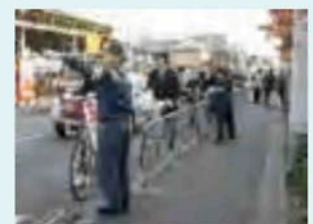
Road guidance of bicycle traffic rules for high school students

The guidance and warning for bicycle rider's traffic violation is strengthened and malicious/dangerous traffic violation that caused concrete risk for the traffic and for pedestrians is repeated after given a warning, the guidance makes strict measures such as an arrest measure to issue a traffic ticket. Moreover, 1,735 places are specified nationwide for the bicycle guidance promotion emphasis area and route. The guidance and warning activities for bicycle riders on roads are promoted in cooperation with volunteers from the regional traffic safety activity promotion committee and local residents.