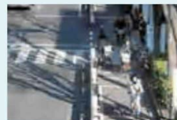
Nakasugi Avenue: Bicycle path community experimental result report

In order to secure the road space that can be used safely by pedestrians, bicycles and automobiles, a pilot program was carried out on a trial basis in cooperation with the Sugunami Ward in Tokyo. This