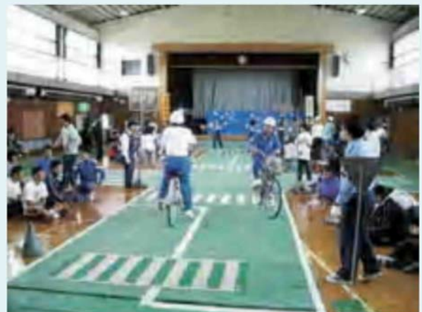
Holding a bicycle class

Moreover, efforts are being made to spread the bicycle traffic rules and the knowledge about what to be done to secure bicycle safety through the seminars for the licensed drivers at the time of renewal of license.