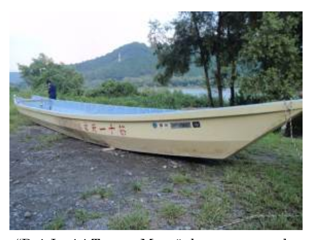
"Dai Juuiti Tenryu Maru" that overturned