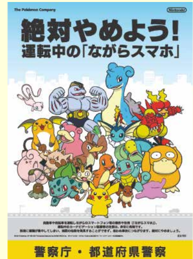
Poster for Public Relations Awareness

Relevant ministries and agencies, in cooperation with local public bodies, concerned authorities and groups, are jointly working to promote overall measures such as call for action on the safety measures for the gaming industry group; for the industry group related to the car transport, a thorough observance of the documents on the prohibition of using cellular phones while working; execution of strict audit and disposal, for the transportation business operator when it becomes clear that the driver had used the cellular phone while working.