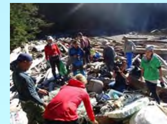
Collection activity at remote Island

The participants to these activities confirmed that they will strengthen cooperation and share further information on the issue.