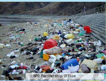
Massive marine debris (Tsuruoka, Yamagata pref.)