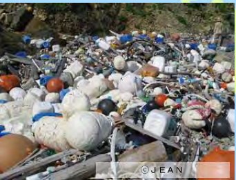
Marine debris (Ohkushi Coast, Nagasaki pref.)