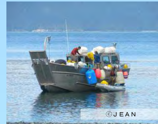
9 hours boarding to port

The workshop found that the Gulf of Alaska Keepers, a local NGO dedicated to collecting tsunami driftage also avoids the fall-spring season and mainly operates during summer when the climate is stable. According to the NGO, a large amount of driftage such as Styrofoam floats or plastic products began reaching the coast from March of 2012. In Montague Island alone, 12 shiploads (one ship amounts to around 42 cubic meters) of what is believed to be tsunami driftage was collected. At the workshop, an official of the State of Alaska said that the compensation money from the Japanese government would be allocated for future collection activities because of their time and cost consuming nature.