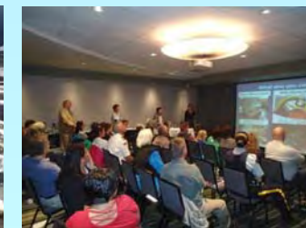
Meeting in Ucluelet Ucluelet in Vancouver Island, B.C.