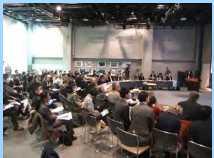
Reporting Forum (Sendai, Miyagi Prefecture)