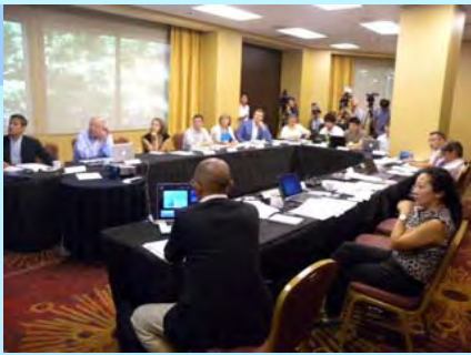
Meeting between U.S and Japan (Portland, Oregon)