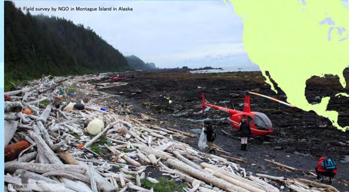
Field survey by NGO in Montague Island in Alaska

The predicted results of forecasts of Tsunami Driftage location published by the MOE shows that surface driftage* 1 and subsurface driftage* 2 will start reaching the West Coast of North America by February 2014, and the amount will start to increase substantially from April to fall.