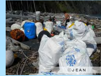
Collection with separation (Montague Island in Alaska)