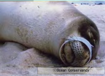
Hawaiian Monk Seal trapped with plastic ring

This Committee is also in charge of planning how to use grants from the government of Japan.