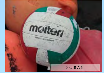
Volley ball printed in "regular game for schoolchildren"