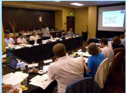
Meeting between U.S and Japan (Portland, Oregon)