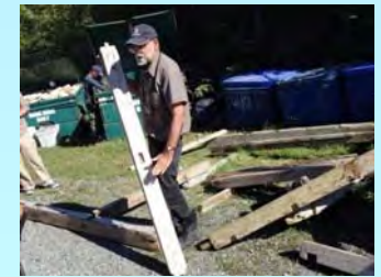
Timber of houses collected for storage