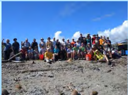
Clean-up activity (Hawaii)