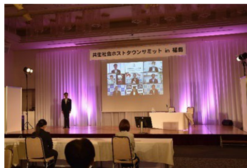
Inclusive Society Host Town Summit in Fukushima (Fukushima City)