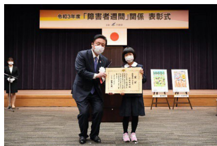
Week for Persons with Disabilities Award ceremony