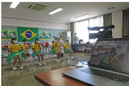
Pre-lodging online exchange (Hamamatsu City)

Initiatives to accelerate the achievement of an inclusive society in regions throughout the nation, and the Initiatives by the Host Towns of Harmonious and Inclusive to link in with the legacy of the Tokyo Paralympic Games are being promoted.