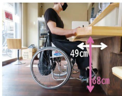
Movable seating (counter seats)