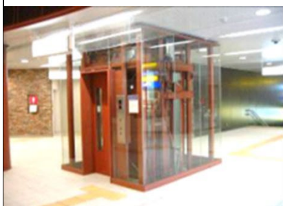
Removing level differences (elevators)

The 2nd Basic Plan on Transportation Policy was decided upon by the Cabinet, and in response to this the FY2022 budget will include the establishment of a new pricing system as a scheme to promote barrier-free railway stations, and an enlargement of the subsidy rates pertaining to facility developments at railway stations, which are positioned as part of the basic barrier-free concepts created by municipalities.