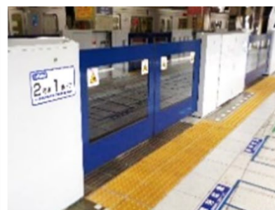
Measures to prevent people falling off platforms (platform doors)

Content of main developments at railway stations