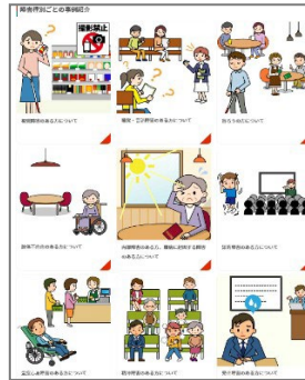
Explanations by each type of disability