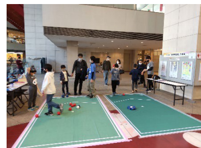
Week for Persons with Disabilities workshop