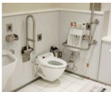
Development of barrier-free toilets