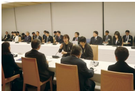
Universal Design 2020 Evaluation Meeting

As a part of promoting various measures towards the realization of an inclusive society based on the Universal Design 2020 Action Plan, the Universal Design 2020 Evaluation Meeting was hosted as a mechanism to reflect the perspectives of persons with disabilities.