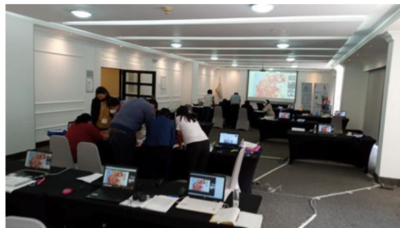
During on-site workshop in Ecuador

The Japan International Cooperation Agency (JICA) has implemented technical cooperation in Ecuador. By sharing practical case studies of Japan's inclusive disaster risk reduction, and conducting training to learn about the formulation of plans and the steps for the consensus building, JICA is supporting the consideration of inclusive disaster risk reduction models in Ecuador and the creation of detailed action plans.