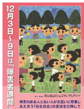
Poster for the Week for Persons with Disabilities