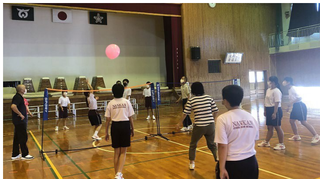
Nagano Prefectural Sports Project for Persons with Disabilities