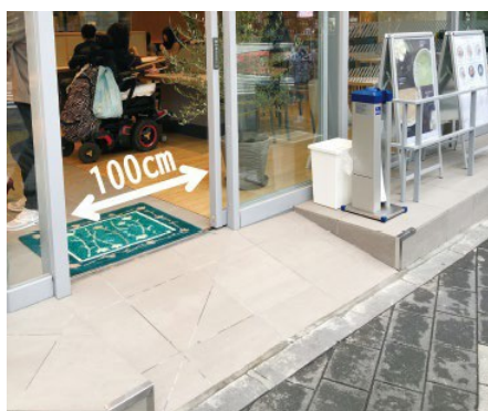
Installation of automatic sliding doors, and removal of different floor levels at entrances

The Design Guidelines of Buildings for Users with Accessibility Needs, which are the guidelines to make buildings barrier-free, have been revised and added how to make small stores and restaurants barrier-free, such as removal of different floor levels at entrances and the installation of moveable seating, as well as improved services with fittings to help support movement, customer care, staff education, etc.