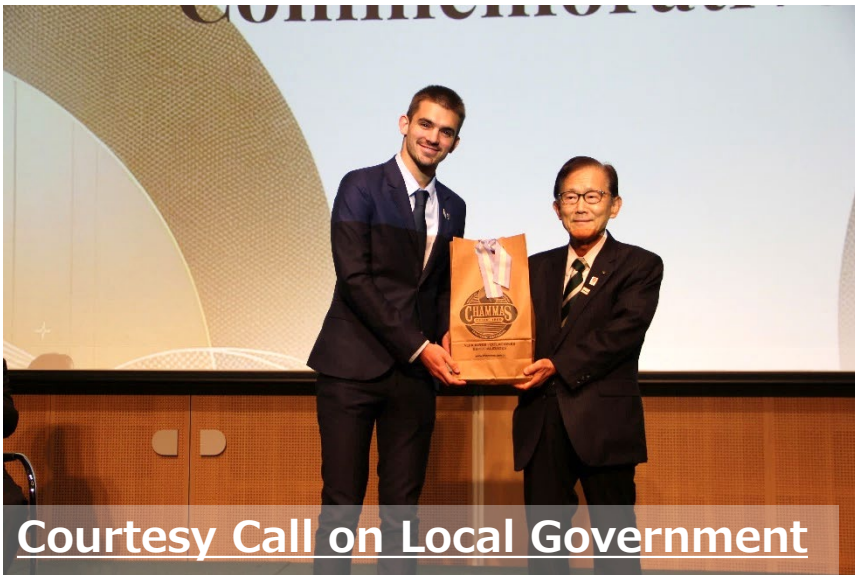
Courtesy Call on Local Government