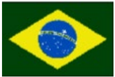
Federative Republic of Brazil