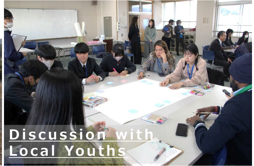
Discussion with Local Youths