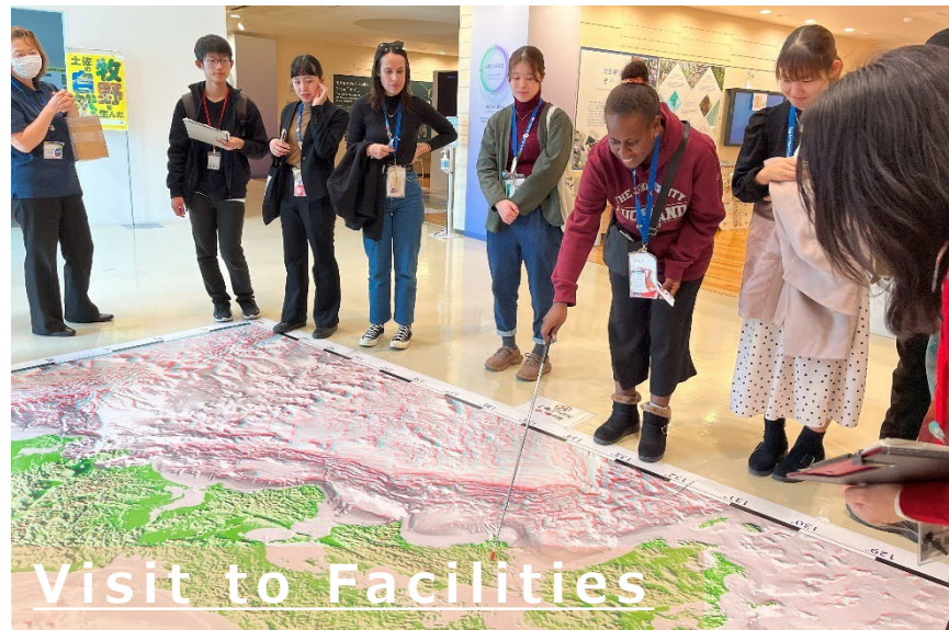
Visit to Facilities