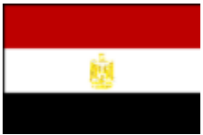
Arab Republic of Egypt