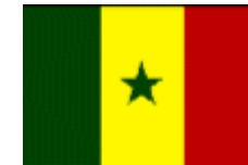
Republic of Senegal