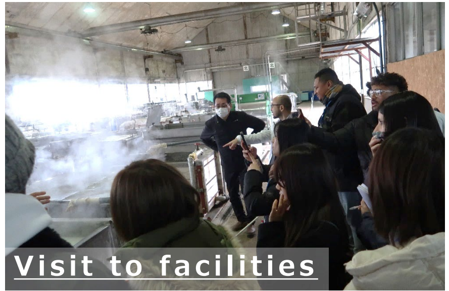
Visit to facilities