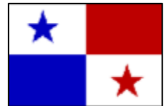
Republic of Panama