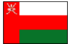
Sultanate of Oman