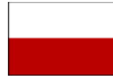
Republic of Poland