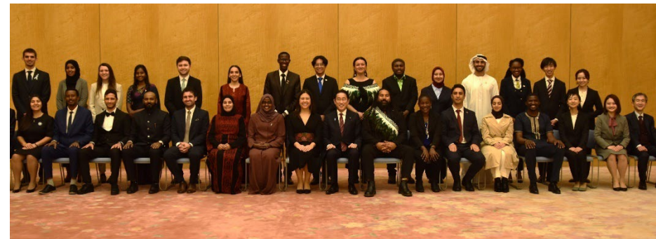
Courtesy call on the Prime Minister