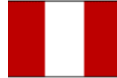
Republic of Peru