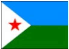
Republic of Djibouti