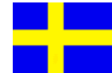
Kingdom of Sweden