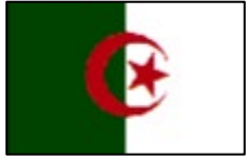
People's Democratic Republic of Algeria