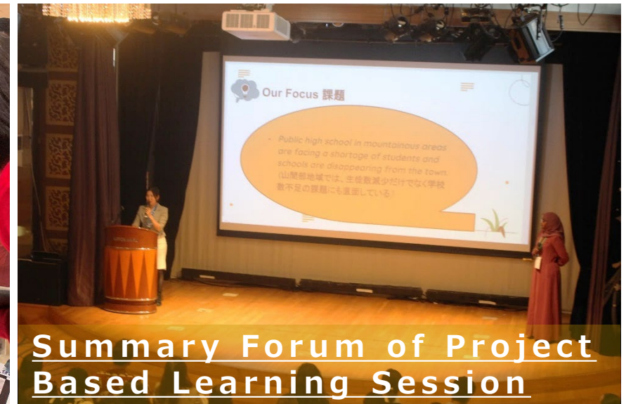
Summary Forum of Project Based Learning Session