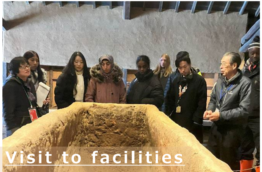
Visit to facilities