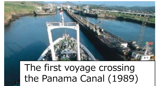
The first voyage crossing the Panama Canal (1989)