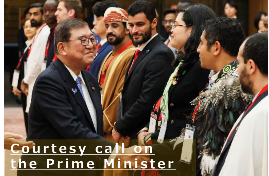
Courtesy call on the Prime Minister