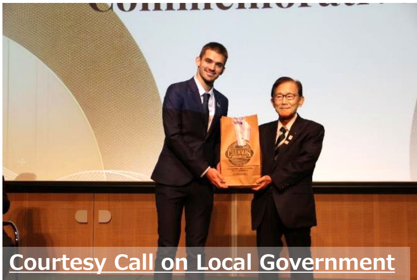
Courtesy Call on Local Government