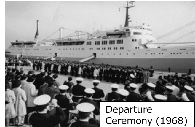
Departure Ceremony (1968)