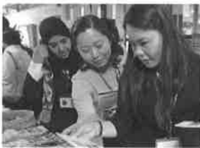
Introduce Oman culture at International Night EXPO