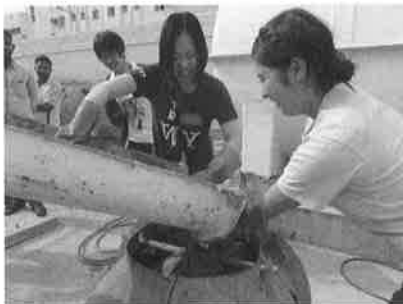
At Reef Arabia, Japanese participating youth experience a process to put concrete into a framework which grows an artificial reef