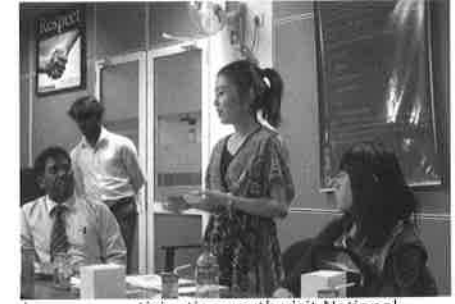
Japanese participating youth visit National Volunteering Secretariat to receive a lecture