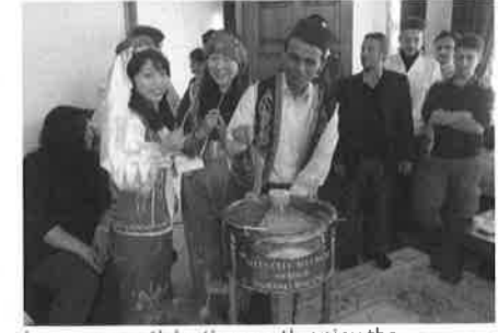
Japanese participating youth enjoy the introduction of Turkish culture and ethnic costume at New World Foundation