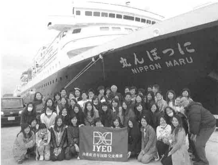
Port of call organizing committee members of Okinawa IYEO and Local Youth

The aim of the port of call in Okinawa was to learn distinctive features of Okinawa based on the institutional visit under the discussion theme: Okinawa Shogaku Senior High School (Cross-Cultural Understanding), Okinawa Christian University (Education), OKINAWA TIMES (Information and Media), Okinawa Girls Square (Social Entrepreneurship), Okinawa International University, Socialwork Studio (Volunteerism). PYs found a lot of difference in Okinawa culture compared to the typical culture of Japan. Even so, it was a surprise to know that people in Okinawa are thinking that their culture are dying out. PYs and the Local Youth had a good experience to visit the city and get to know the people of Okinawa.