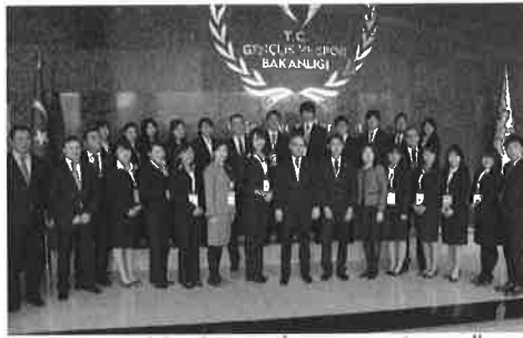
Japanese participating youth pay a courtesy call on Minister Akif Cagatay Kilic, of the Ministry of Youth and Sports