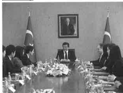
Japanese participating youth pay a courtesy call on Prime Minister Ahmet Davutoglu