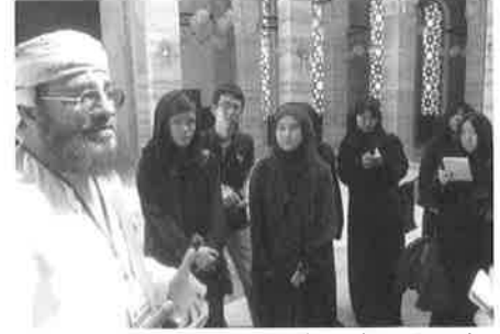
Japanese participating youth learn how to make a prayer in a mosque at Al Fateh mosque