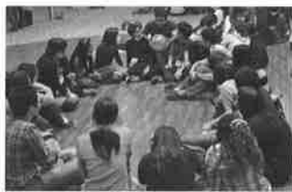
Exchange idea with the Local Youth in Okinawa