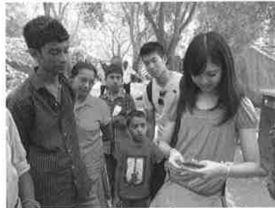
Japanese participating youth communicate with host families while teaching Origami