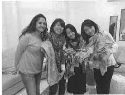
Japanese participating youth receive scarves as a gift from the host family during the home visit