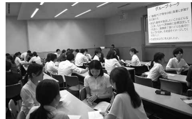
Team building (August 4)

The Japanese PYs followed a training schedule and had an opportunity to listen to lectures, advice from ex-PYs, an explanation of the overseas travel procedures, etc. During the training, they decided role-sharing arrangement for the preparation of onboard activities and country programs.