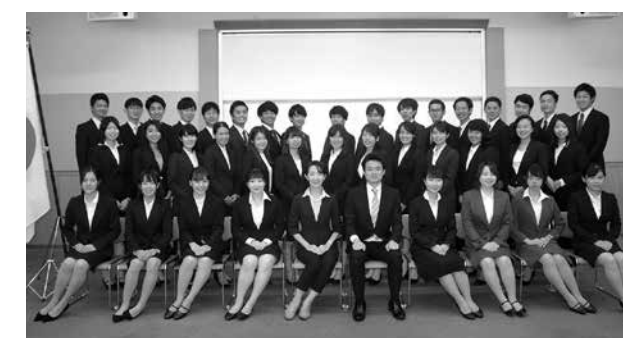
Japanese PYs completed the Pre-Program Training (August 9)