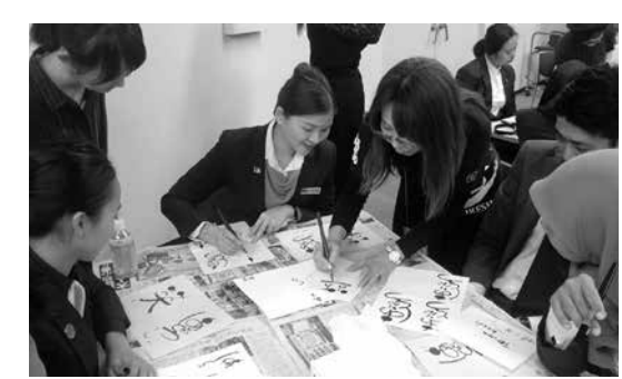
Calligraphy experience at Japan-ASEAN Youth Exchange Program (October 26)