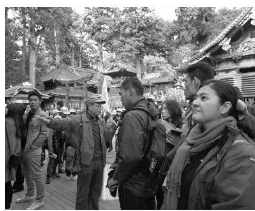
Visit to Nikko Toshogu, Tochigi Prefecture (October 26)