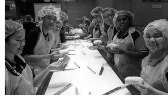
Experience Kamaboko (fish sausage) making at Suzuhiro Kamaboko no Sato (October 29)