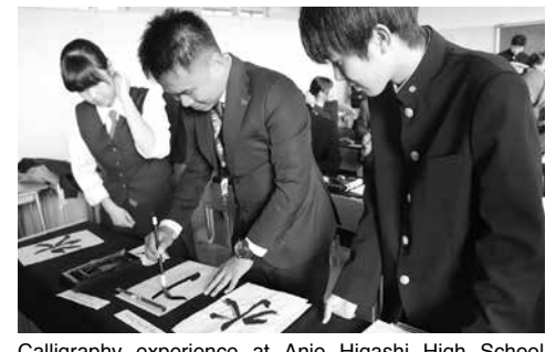
Calligraphy experience at Anjo Higashi High School (October 26)