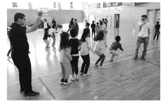
Visit to Koken Daini Elementary School, Koriyama City (October 26)