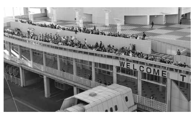
Family and friends came to send off at Tokyo Port (November 2)

After the Send-off Ceremony, Nippon Maru set sail from Harumi Pier of Tokyo Port to Brunei Darussalam at 16:00