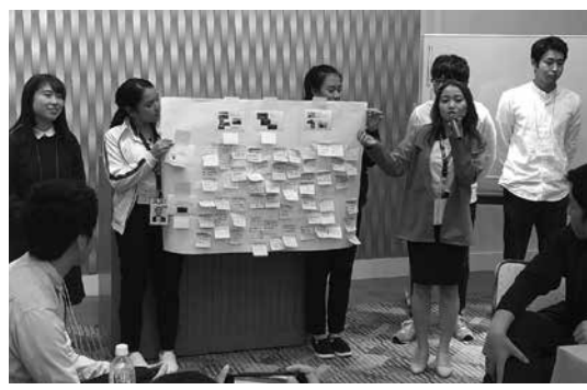
Discussion Activity at Japan-ASEAN Youth Exchange Program (October 28)