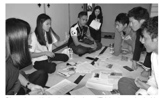
Discussion with local youth about "Think about sistainable community plannning from the point of SDGs" (October 28)