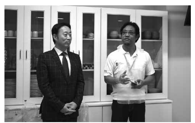
Courtesy Visit of Mr. Fukuda Yoshihiko, Mayor of Iwakuni City (October 26)