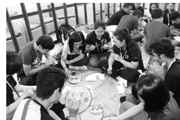
[S4] "Bamboo in Viet Nam's traditional handicrafts" by Viet Nam

in one session (75 minutes) or two consecutive sessions (75 minutes x 2).