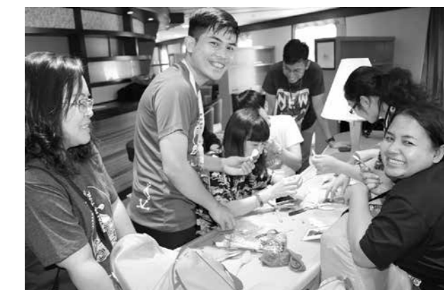
[S20] "Charming yourself, Champa" by Lao P.D.R.

The PY Seminars organized during the 45th SSEAYP were as per the following table.