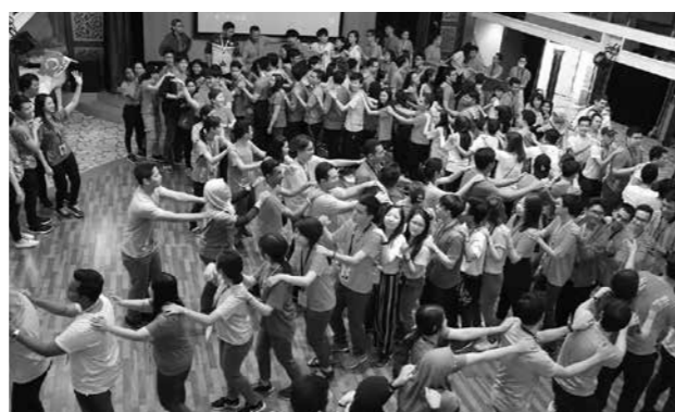
SG Activity (November 7)