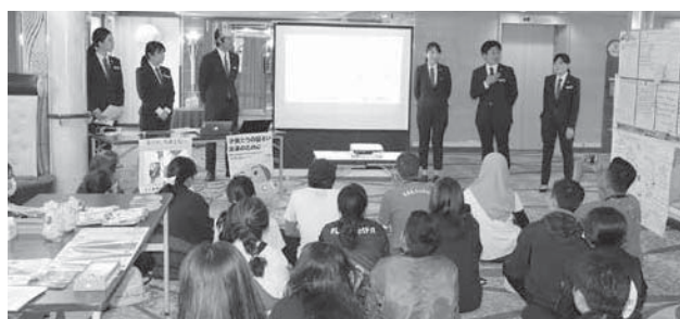
[S2] "Let's Know about CUSTOMS Jobs!!!" by Japan