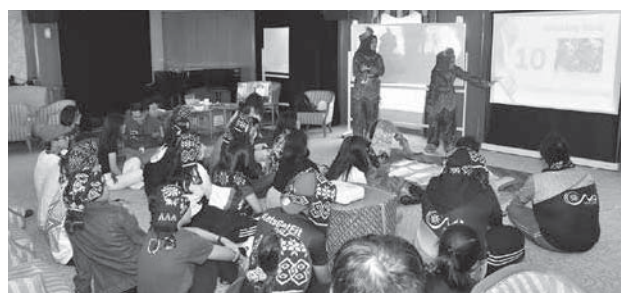
[S57] “12 Amazing Etiquettes of Minangnese” by Indonesia