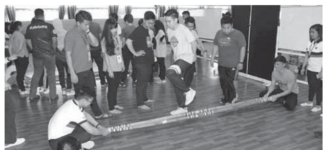
[S5] "¡HALA BIRA! A Celebration of Filipino Folk Songs and Dances" by the Philippines