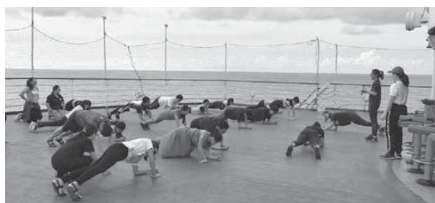
[S55] “Healthy Life, Happy Life” by Singapore