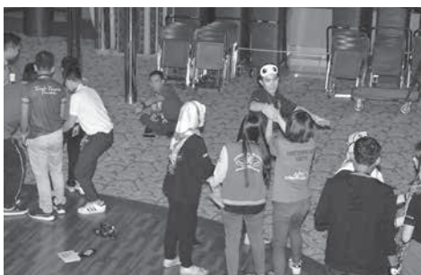
[S19] "SERVANT LEADERSHIP: A Mark of Character Not Skill" by the Philippines