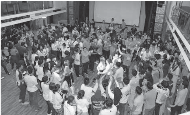
SG Activity (November 8)