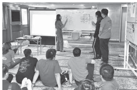
[S31] "The Unique Secrets behind Burmese Names" by Myanmar