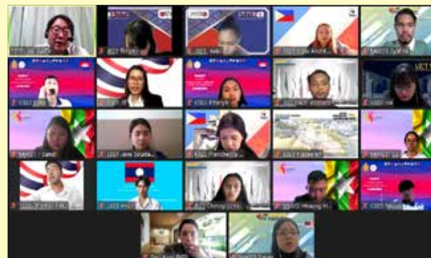
Ministry of Foreign Affairs of Japan (Diplomacy Group)