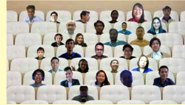
Mitsui Fudosan Co., Ltd. (Infrastructure Group)