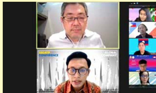
EY Japan Co., Ltd. (Global Company Group)