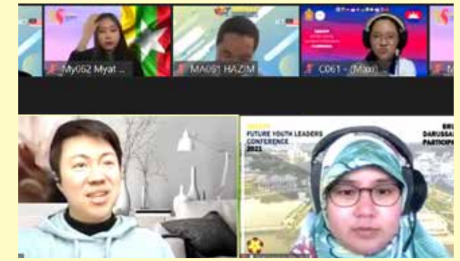
IT Director of Multinational Clothing Company (ICT Group)