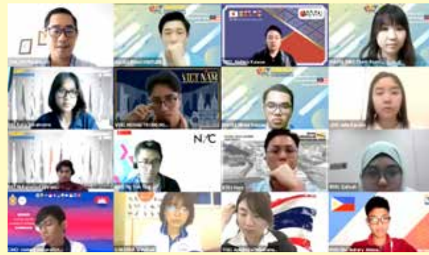
Environment and Disaster Risk Reduction Group