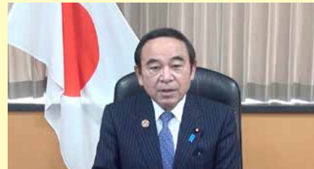
Remarks by Mr. Sakamoto Tetsushi, Minister of State for Youth Affairs, Cabinet Office (January 24, 2021)