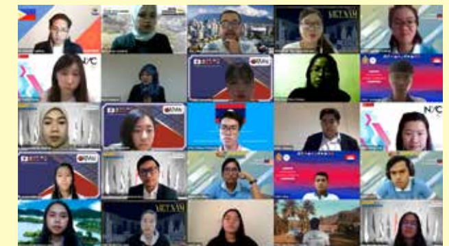
Global Company Group