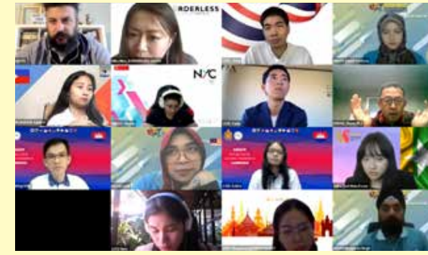
Borderless Japan Corporation (Entrepreneurship Group)