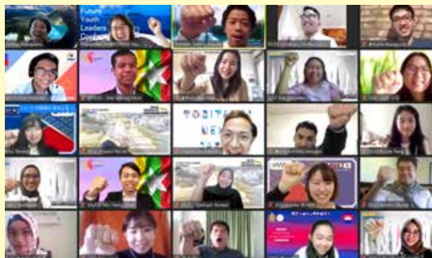
Tobitate! (Leap for Tomorrow) Study Abroad Initiative (Education Group)