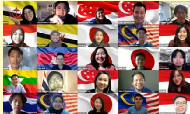
SSEAYP Conference for Considering its Role and Significance