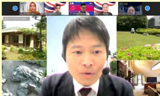
The Matsushita Institute of Government and Management (Policy Group)