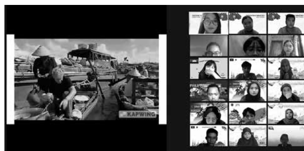
“The Vietnamese Floating Market” by Viet Nam