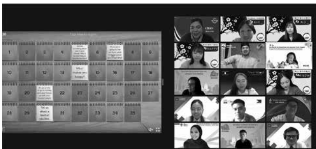
Answering the questions by tapping the numbers (SG-A)

under the planning and facilitation by NLS, PYs had the opportunity to get to know each other by introducing themselves, sharing the expectations towards the Program, etc.