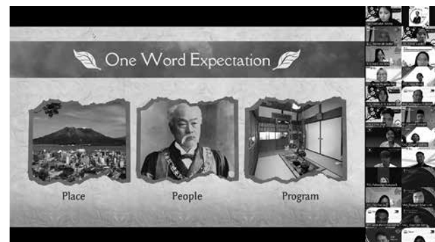
Sharing the expectations for the local program (SG-E)