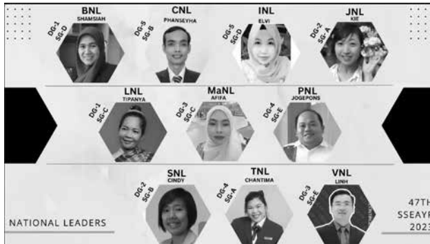
Introduction of NLS of each country

In NL Session, each country introduced their own country by video and music. PYs also enjoyed quiz by