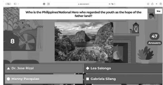
Quiz of the participating countries

using game-based learning platform “Kahoot” to deepen their understandings and learnings about ASEAN and Japan.