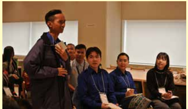
Presentation of what was discussed (Quality Education Group)