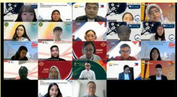
Sharing the mindset before starting discussion (November 12)