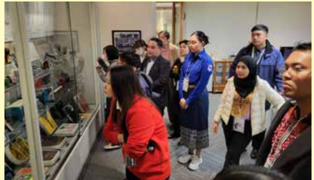
Learning about changes of our perspectives towards the health at TANITA Museum (Good Health and Well-being Group)