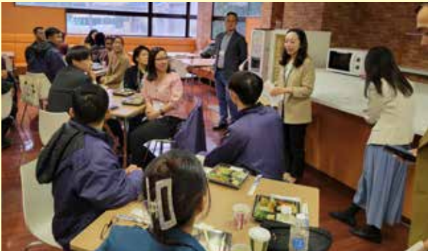
Explanation about the lunch boxes made with well-balanced ingredients at TANITA Corporation (Good Health and Well-being Group)