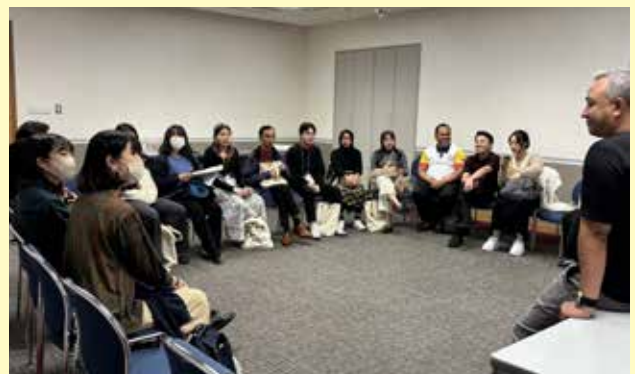
Sharing their ideas as a whole group