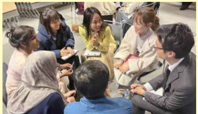
Discussion about the gender gap with staff members of PERSOL TEMPSTAFF CO., LTD. (Gender Equality and Women's Empowerment Group)