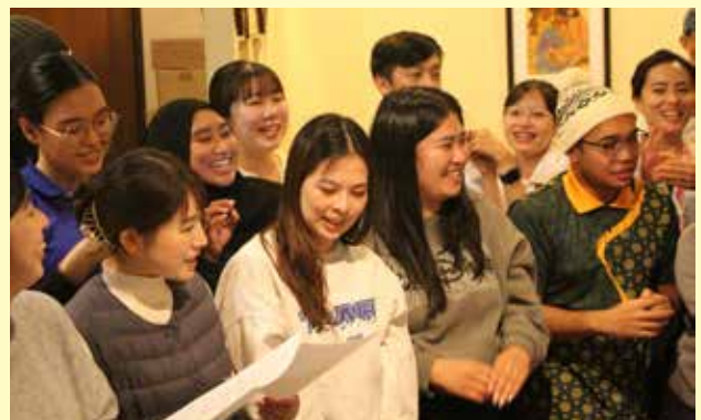
Singing a song together with local youths after dinner (December 3)