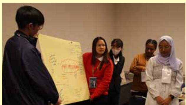
Presentation of what was discussed in the group