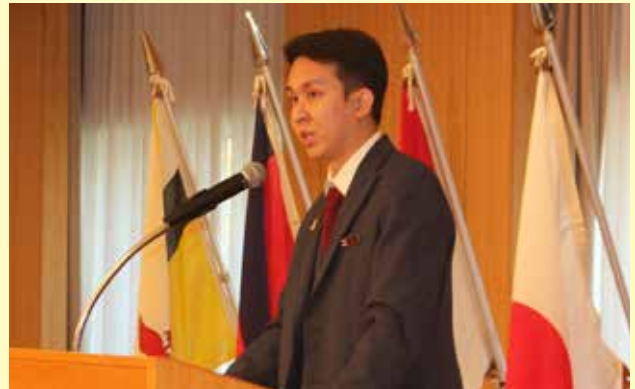
Speech by Youth Leader of Thailand