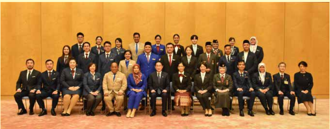
National Leaders, Youth Leaders and Assistant Youth Leaders (December 6)