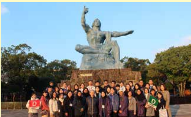
Visit to Peace Memorial Park (December 3)