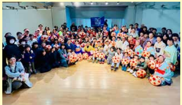
Group photo with local youths after Hanagasa dance experience (December 2)