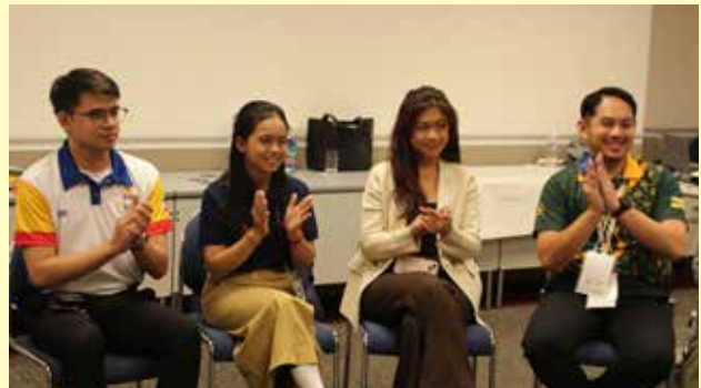
Active listening when exchanging ideas