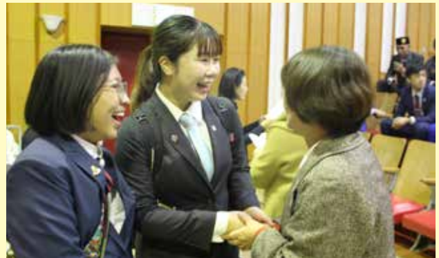
First meeting with host family at Homestay Matching (December 1)