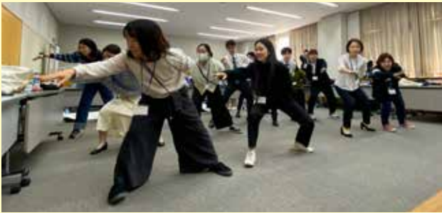
Dancing practice for cultural performance (October 29)