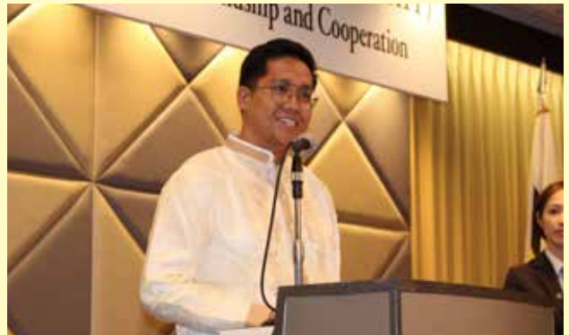
Speech by Assistant Youth Leader of the Philippines