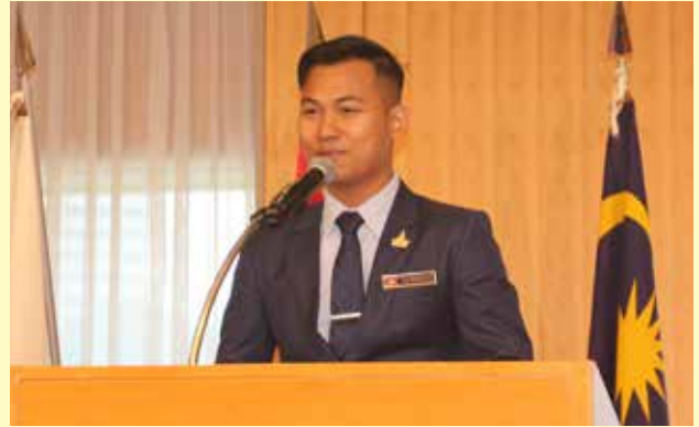
Speech by Youth Leader of Cambodia