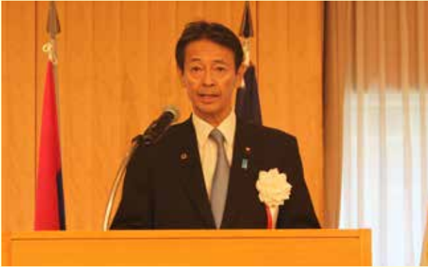
Opening remarks by Mr. KUDO Shozo, State Minister of the Cabinet Office