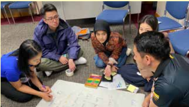
Summarizing their opinions by group