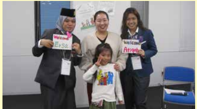
First meeting with host family (December 1)