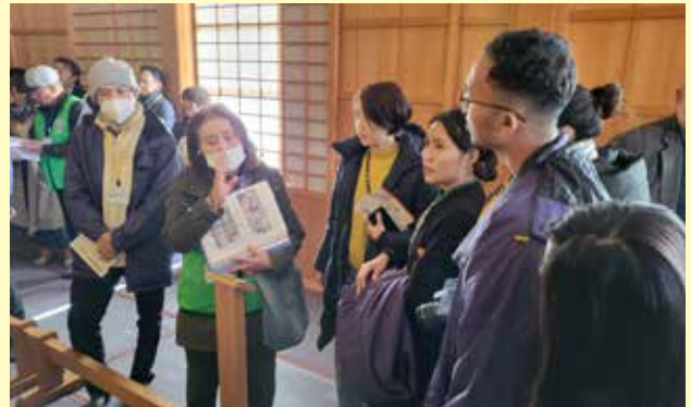
Listening to the explanation from a local guide at Nagoya Castle (December 4)