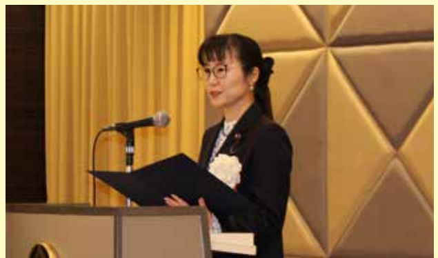
Speech by Ms. KATO Ayuko, Minister of State for Youth Affairs of the Cabinet Office