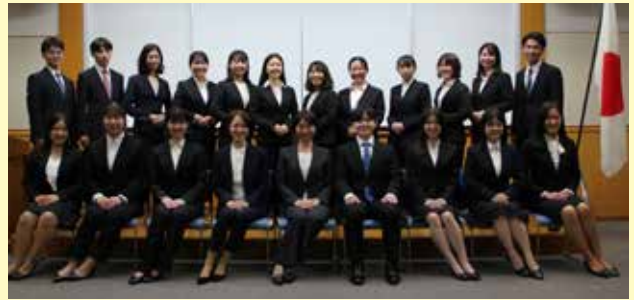
National Leader and Participating Youths of Japan contingent (October 29)