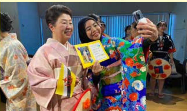
Interaction with local people through Kimono wearing experience (December 2)