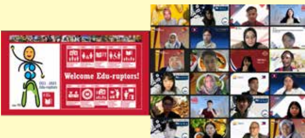
Introduction to the discussion topics and objectives (November 12)