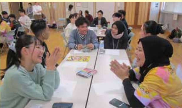
Interaction with local youth (December 3)