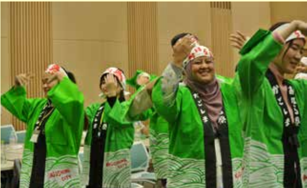
Dance experience of "Ohara Bushi" with local youths (December 3)