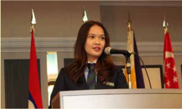
Speech by Youth Leader of Viet Nam at the Farewell Ceremony