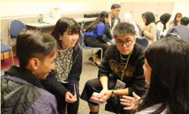
Exchanging the opinions in small groups