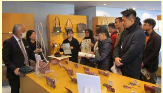
Visit to the head office and factory of Indenya Uehara Yushichi Ltd. (December 4)