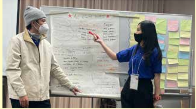
Presentation on ideas how to utilize the learnings from discussion activities in each country after the program