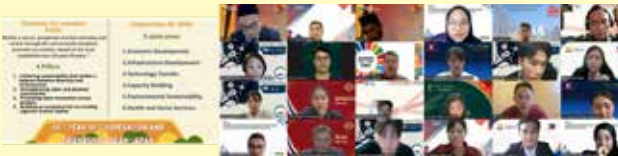
Understanding the basis of the discussion (November 12)