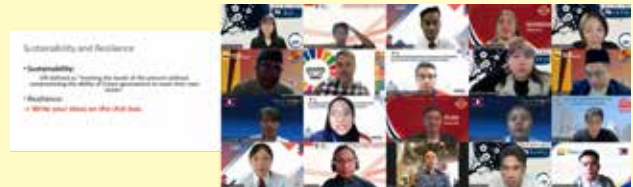
Idea generation on sustainability and resilience (November 19)