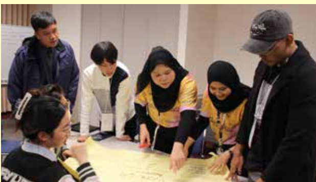
Sharing their opinions on work-life balance