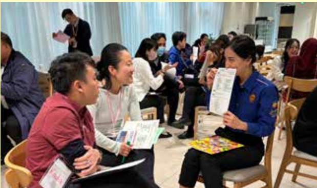
Global Citizenship Workshop conducted by GiFT (Quality Education Group)