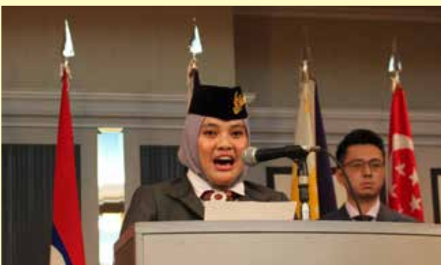
Speech by Assistant Youth Leader of Indonesia, at the Farewell Ceremony