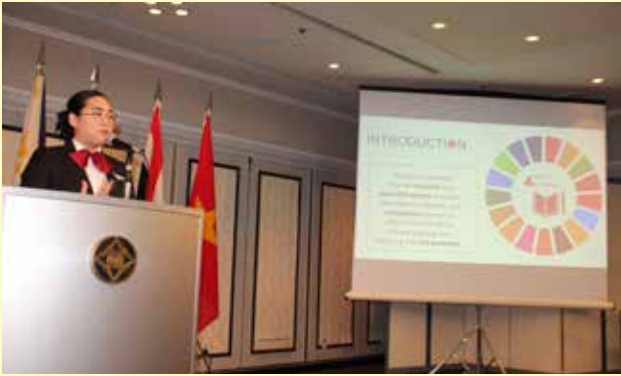
Presentation on their learnings such as concepts and ideals of the quality education (Quality Education Group)