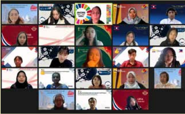
Sharing the mindset before starting discussion (November 12)