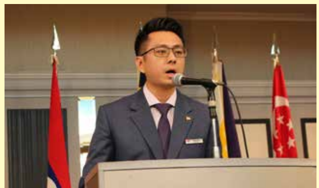
Speech by Youth Leader of Singapore, at the Farewell Party