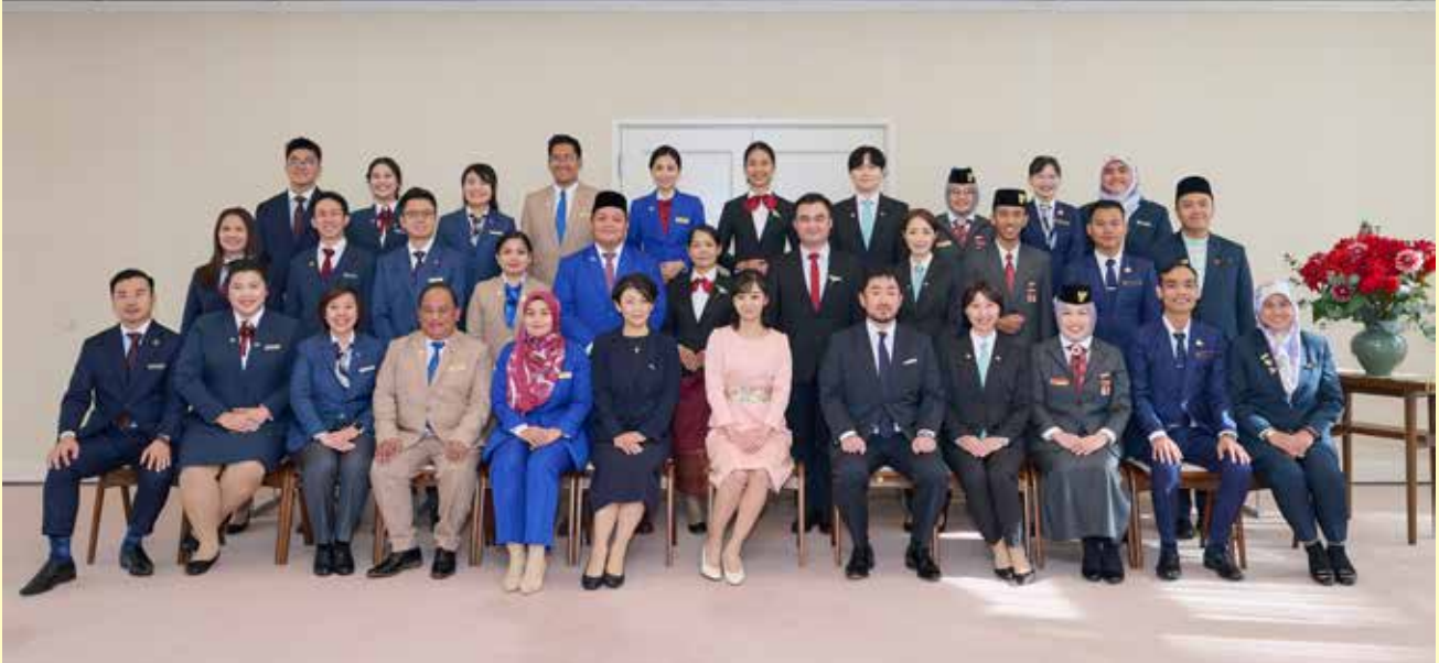
National Leaders, Youth Leaders and Assistant Youth Leaders (December 6)