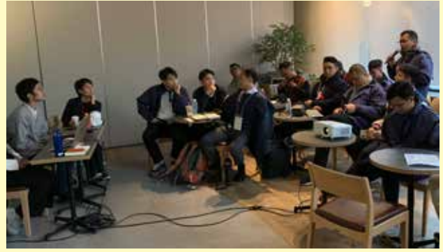
Sharing ideas and suggestions after the walking tour around the town (Economic Growth and Sustainable Cities and Communities Group)