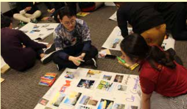
Understanding the current situation in ASEAN member countries and Japan through photos of communities in their own country