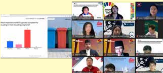
Quiz on the common sense regarding the recycling-oriented society (November 12)