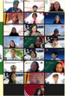
Learning the relationships among diversity, equality, and inclusion (November 19)