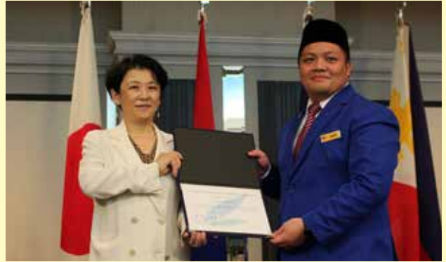
Awarding of the Certificates of Completion to Participating Youths from each country (Youth Leader of Malaysia)