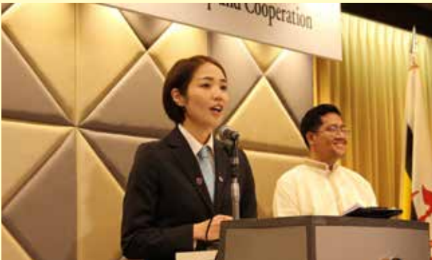
Speech by Youth Leader of Japan