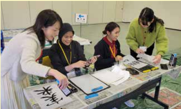
Japanese calligraphy experience with local youths (December 3)