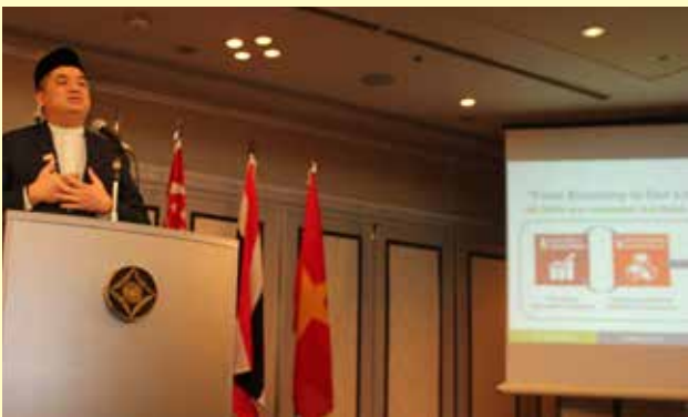
Presentation about the learnings such as approaches to balancing economy and community development (Economic Growth and Sustainable Cities and Communities Group)