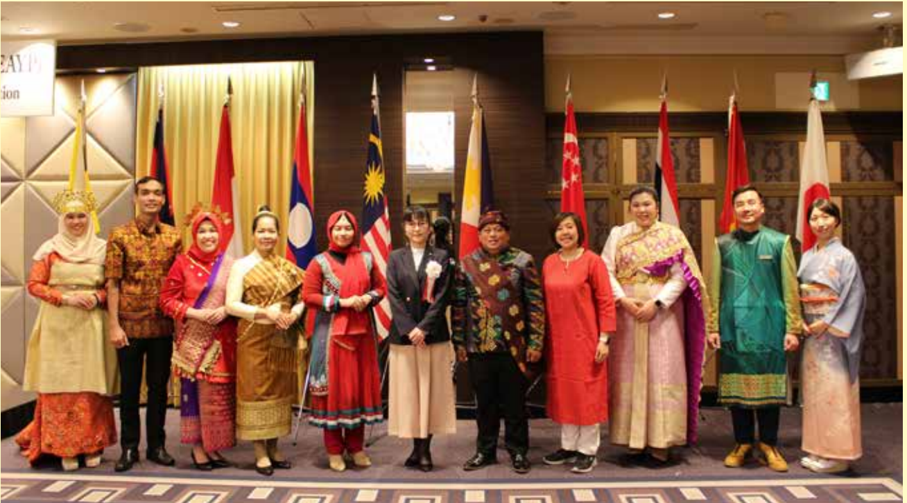
Ms. KATO Ayuko, Minister of State for Youth Affairs of the Cabinet Office and National Leaders