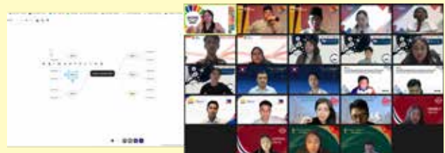
Opinion exchange by using online whiteboard (November 19)