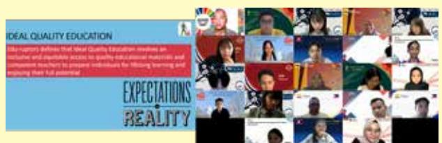
Discussion on the ideal education (November 19)