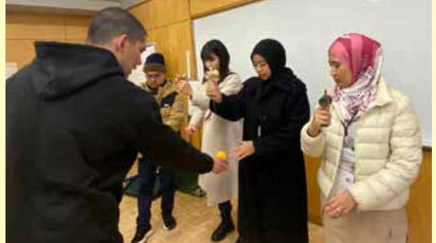
Kendama experience under the guidance of an instructor (December 2)