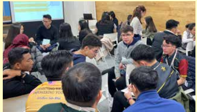
Discussion on how to approach climate change (Energy, Measures against Climate Change, Recycling-Oriented Society Group)