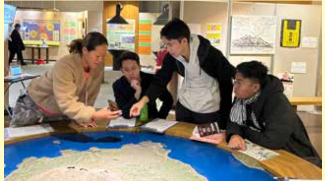
Visit to Sakurajima Visitor Center with host family (December 2)