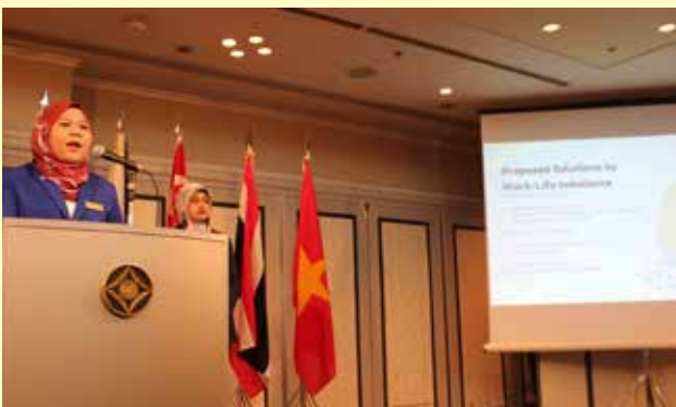
Presentation about the work-life balance proposals (Good Health and Well-being Group)