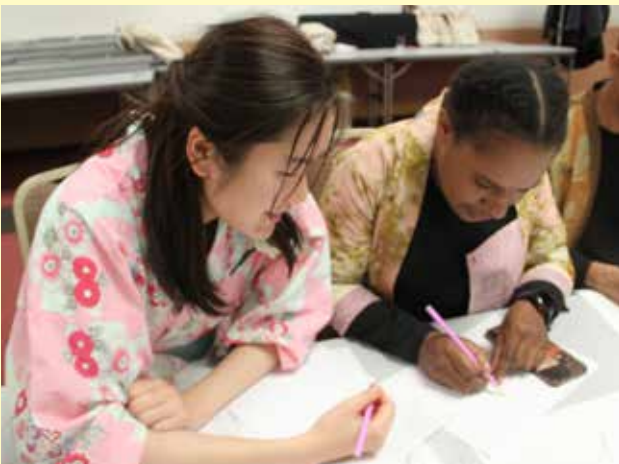
Writing your own name in Japanese characters "Hiragana" (Japan)