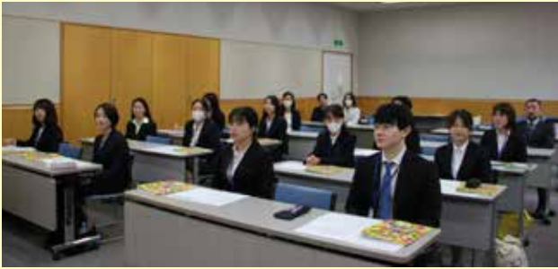
Orientation (October 28)