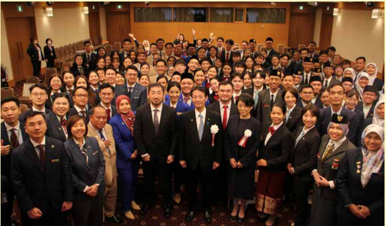
Group Photo of all participants