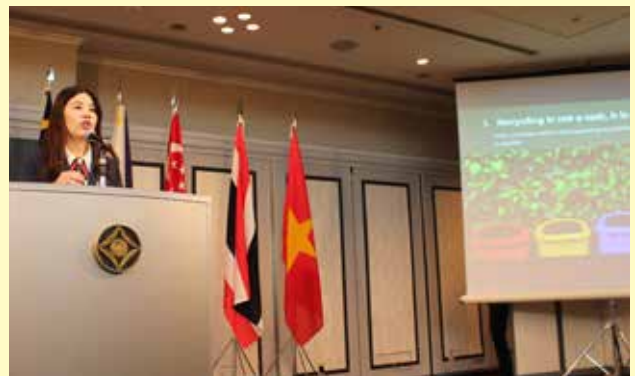
Explanation of the recycling which is our responsibility, not a task (Energy, Measures against Climate Change, Recycling-Oriented Society Group)