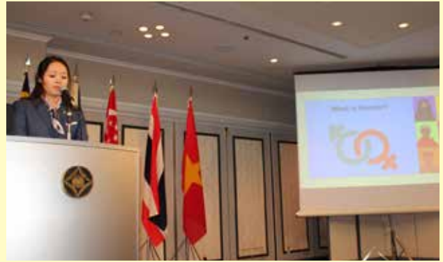
Sharing the concept of gender (Gender Equality and Women's Empowerment Group)