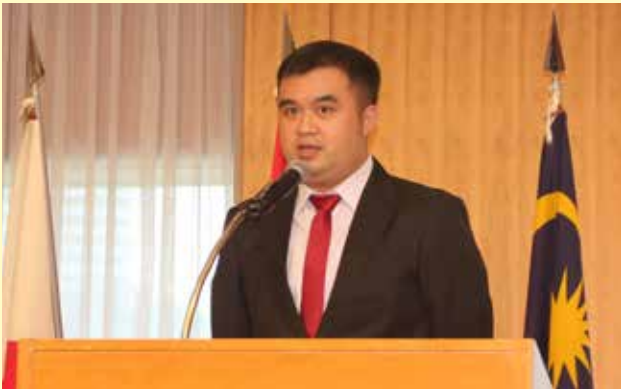
Speech by Youth Leader of Lao P.D.R.