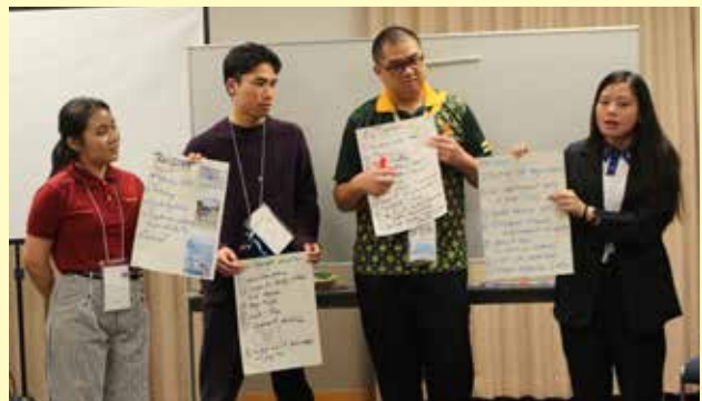
Sharing their ideas to the whole group