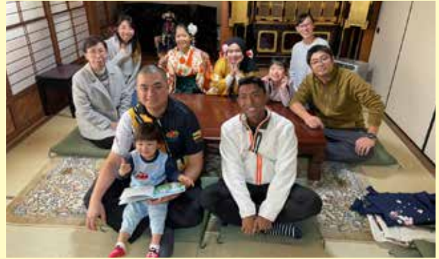
Family gathering during homestay (December 2)