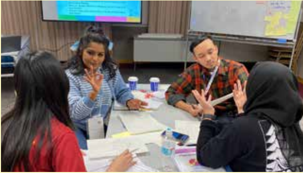
Discussion in a small group