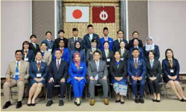
Courtesy Call on Mr. OHMURA Hideaki, Governor of Aichi Prefecture (December 1)