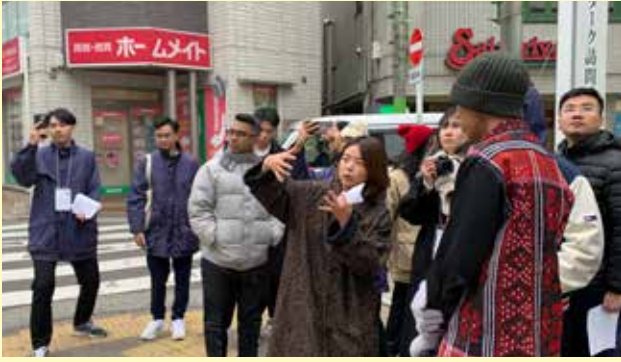
Walking around the town to learn about urban development projects undertaken by HITOTOWA INC. (Economic Growth and Sustainable Cities and Communities Group)