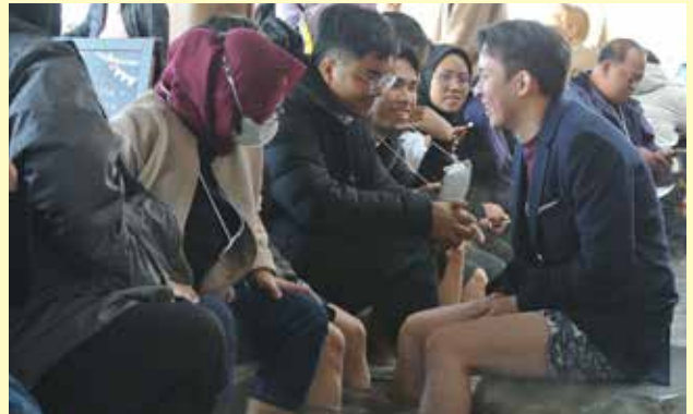
Footbath experience (December 4)