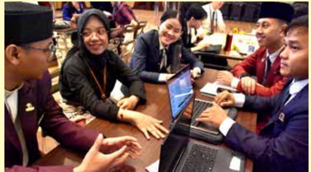
Sharing ideas about Business model (DG2 Economic Growth and Sustainable Community Group)