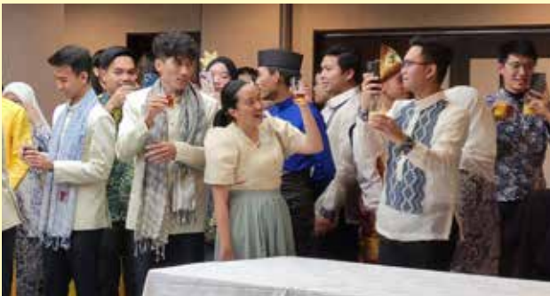
Participating Youth chatting pleasantly at the Welcome Reception (6th December)