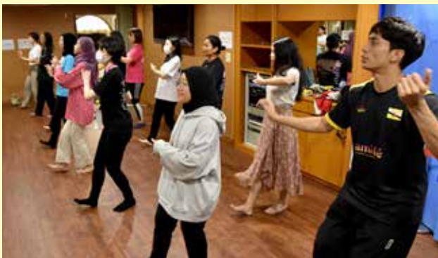
Brunei Traditional Dance Class