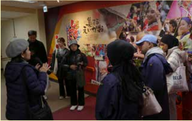
Visiting the Kochi Yosakoi Information Center with locals (8th December)