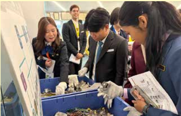
Visit to Tokyo Environmental Public Service Corporation to see examples of industrial waste utilization (DG3 Global Environment and Climate Change Group)