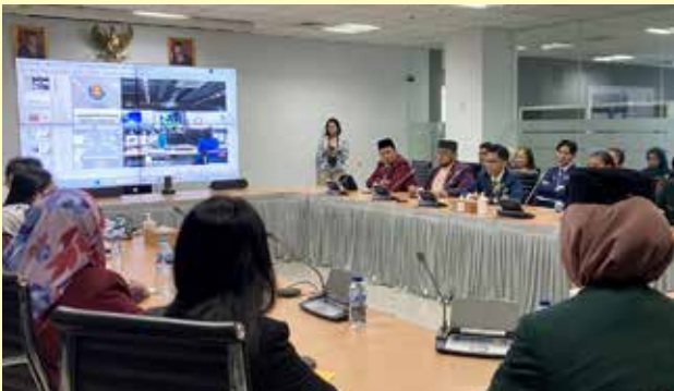
Participating Youth visit ASEAN Coordinating Centre for Humanitarian Assistance on disaster management (DG4 Disaster Risk Reduction and Recovery Group) (22nd November)