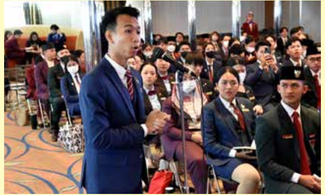
Participating Youth ask a question about the contents of the presentation.