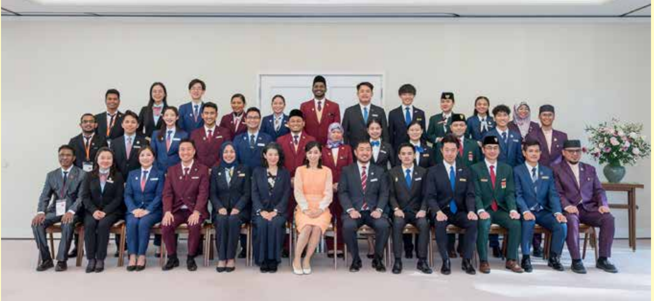
National Leaders, Youth Leaders and Assistant Youth Leaders (10th December)