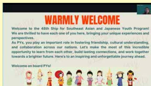
Beginning of the NL session