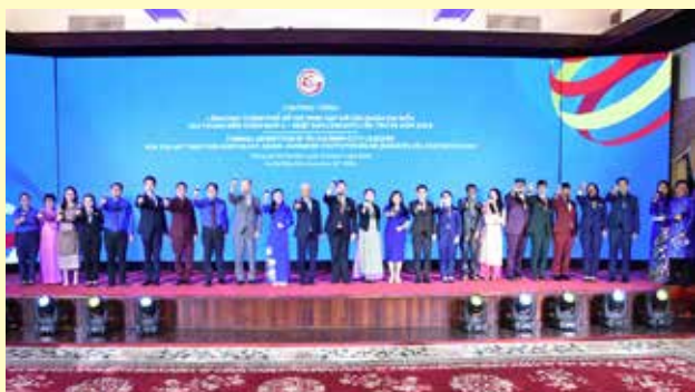
Toast at Welcome Dinner (14th November)