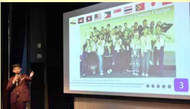
Presenting the discussion result (DG3 Global Environment and Climate Change Group)