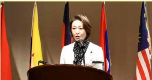
Remarks by Ms. Junko MIHARA, Minister of State for Youth Affairs of the Cabinet Office