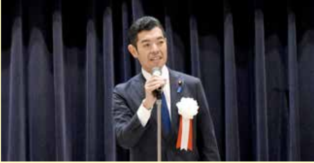
Mr. Kiyoto TSUJI, State Minister for the Cabinet Office, delivers his speech