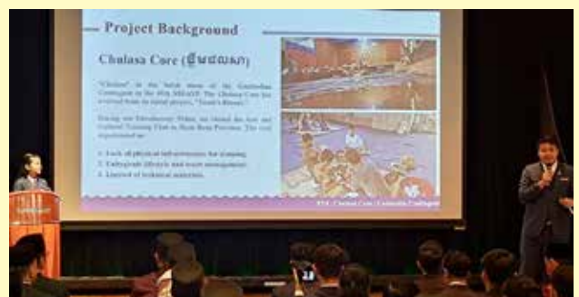
Explaining "Chulasa Core", which aims to preserve and promote culture and renovate infrastructure (Cambodia)