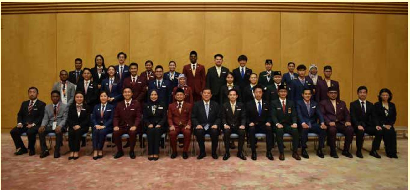
National Leaders, Youth Leaders and Assistant Youth Leaders (4th December)