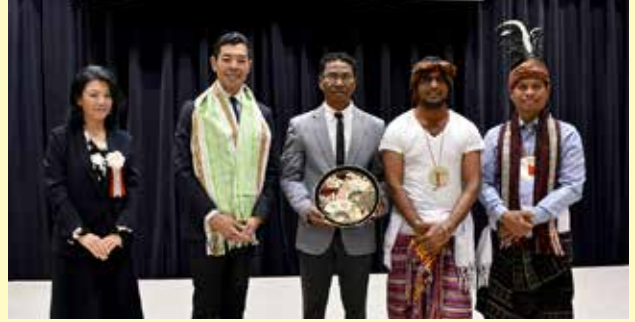
Mr. Kiyoto TSUJI, State Minister for the Cabinet Office and National Leader of Timor-Leste (observer country) exchange gifts