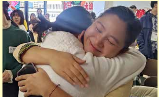
Participating Youth promising to be reunited with their host families (8th December)