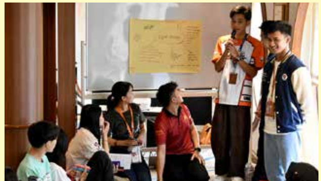
Presenting what was discussed in the group (DG6 Digital Society Group)