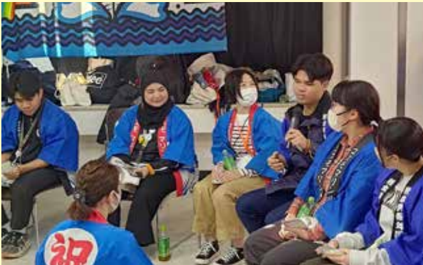
Enjoying exchanging ideas with local youth (8th December)