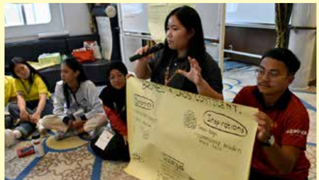
Presenting what was discussed in each country (DG4 Disaster Risk Reduction and Recovery Group)