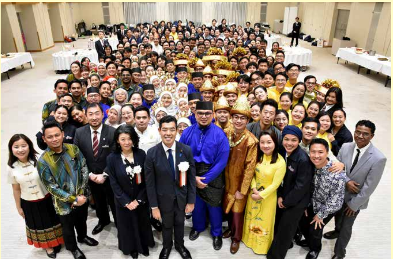
Group Photo of all participants