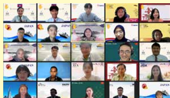
Introductory Meeting by DG (DG1 Soft Power and People to People Diplomacy Group)