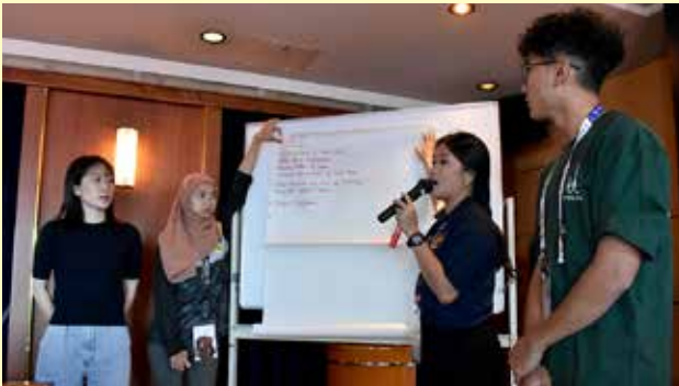
Sharing their opinions from field study (DG1 Soft Power and Youth People to People Diplomacy Group)