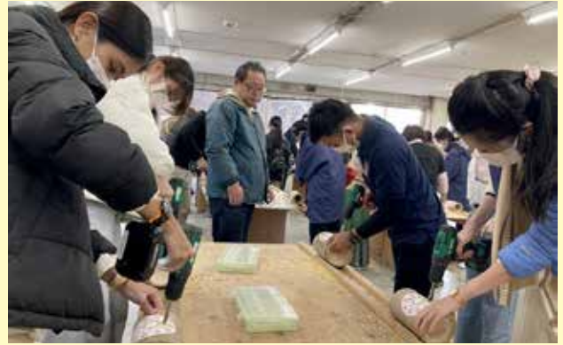
Bamboo lantern making experience with local youth (8th December)