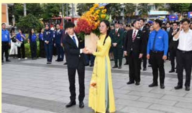
Representatives of Participating Youth offering flower at a flower offering ceremony at President Ho Chi Minh Monument (14th November)