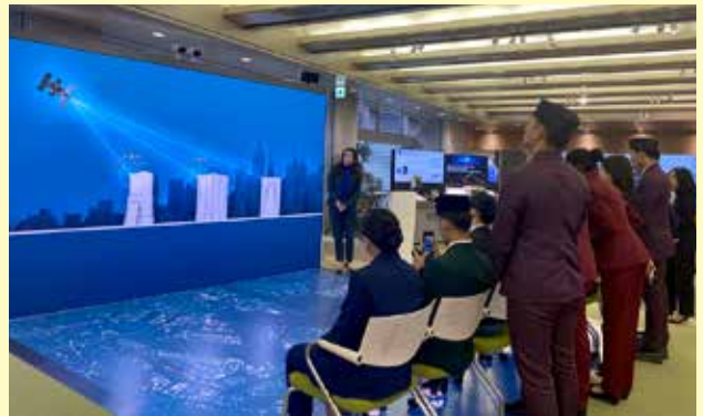
Visit to NEC Future Creation Hub and listening about the Innovation in Business and Society (DG6 Digital Society Group)