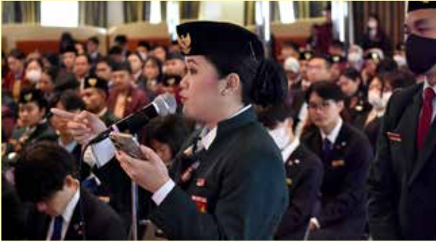
Participating Youth asking questions actively about the contents of the presentation