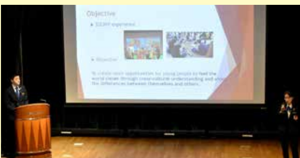
Presenting "Mini SSEAYP" to increase opportunities for youth to experience different cultures (Japan)