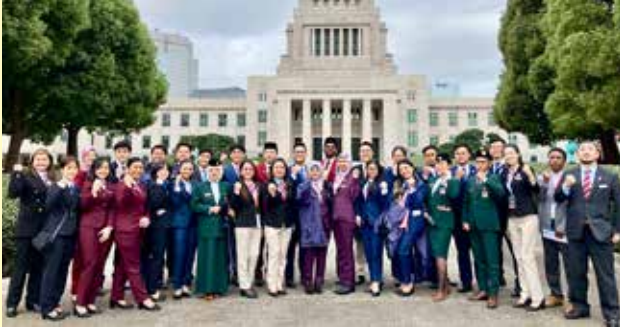
Visit to The Parliament Building (DG1 Soft Power and Youth People to People Diplomacy Group)