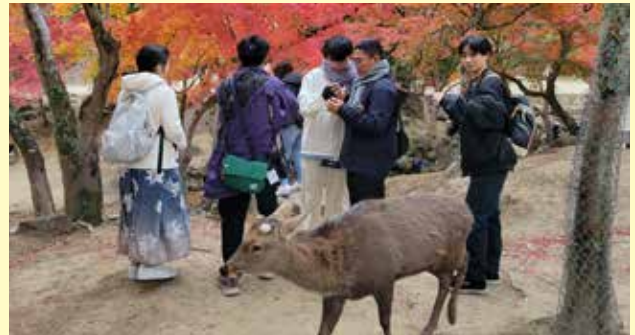
Walk around Nara Park (6th December)