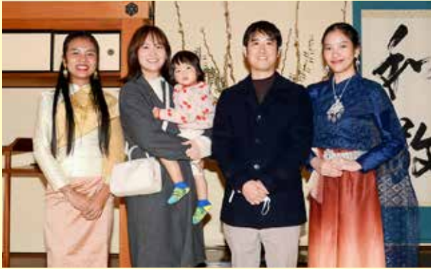
First meeting with host family at Homestay Matching (6th December)