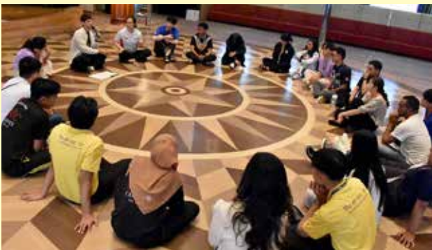
Sharing ground rules before starting a discussion (DG3 Global Environment and Climate Change Group)