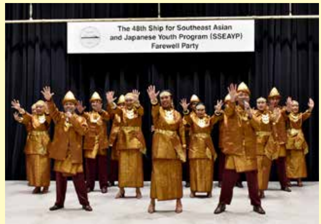
3 minutes performance by each country (Indonesia)