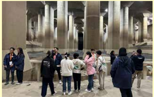
Tour inside Tokyo Metropolitan Outer Area Underground Discharge Channel (DG4 Disaster Risk Reduction and Recovery Group)