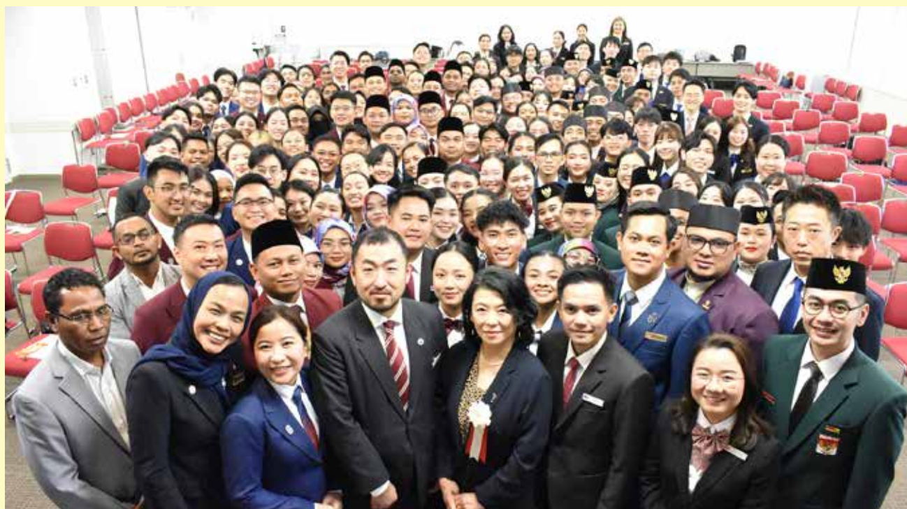
Group Photo of all participants