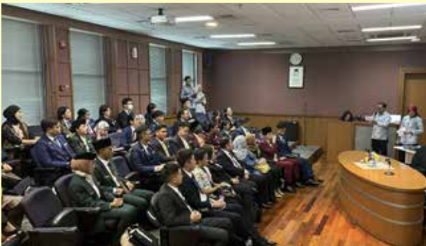
Participating Youth visit Bank Indonesia (DG1 Soft Power and People to People Diplomacy Group) (22nd November)