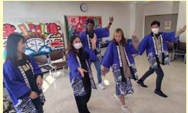
Dancing the Ushibuka Haiya Dance with local youth (8th December)