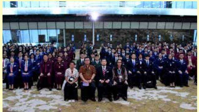
Group Photo at ASEAN Secretariat (22nd November)