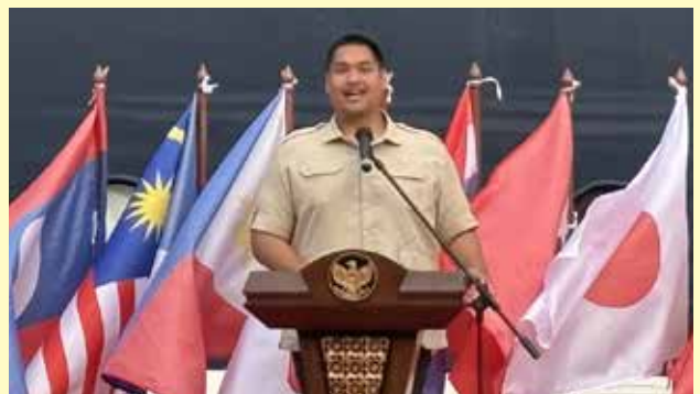
Mr. Ario Bimo Nandito Ariotedjo, Minister of Youth and Sports, delivers a speech at Departure Ceremony (25th November)