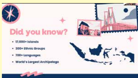
Introducing each country and Participating Youth at the NL session