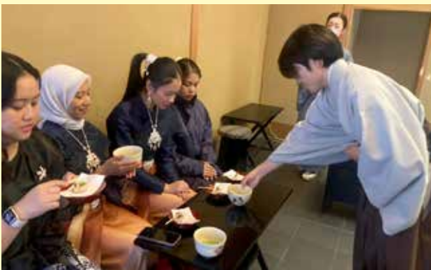
Experiencing Tea Ceremony (6th December)