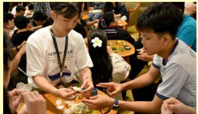
Champa Pin Making