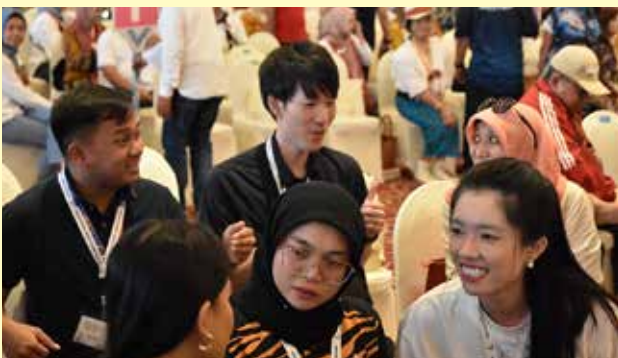
Meeting host family (23rd November)