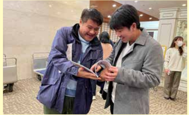
Interaction with local youth (8th December)