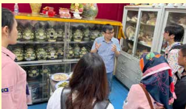
Participating Youth visit University of Medicine and Pharmacy at Ho Chi Minh City (DG5 Good Health and Well-being Group) (15th November)