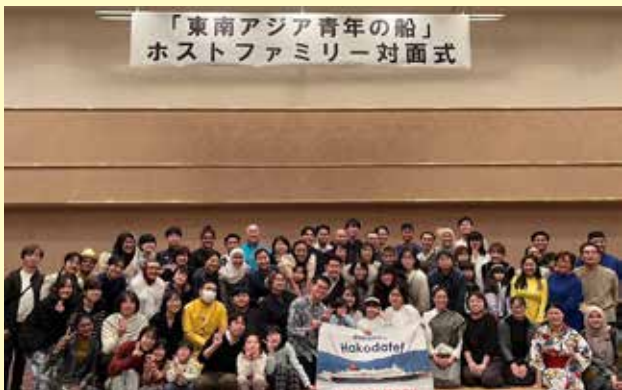
Group Photo at Homestay Matching (7th December)