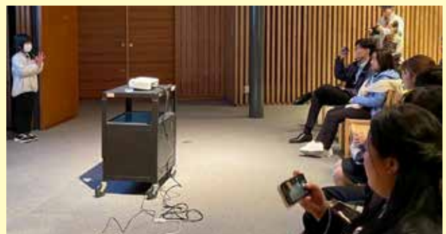
Listening to the explanation by a child guide at Makino Botanical Garden (6th December)