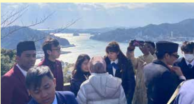
Enjoying the view of Kochi at Godaisan Observatory (6th December)