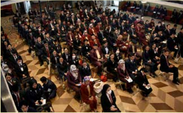
Active listening to presentations for discussion results.