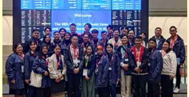
Group Photo at Tokyo Stock Exchange (DG2 Economic Growth and Sustainable Community Group)