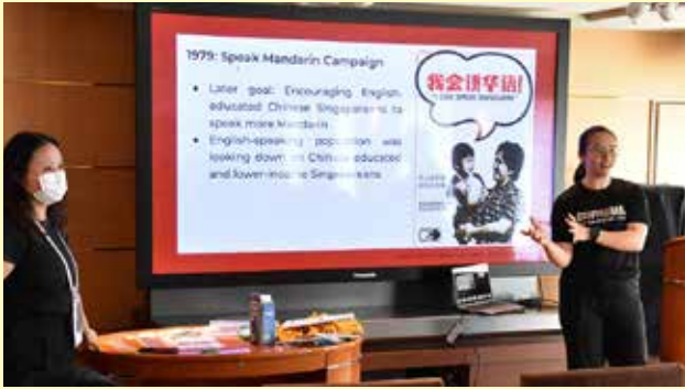
[S12] "SINGAPORE IDENTITY" by Singapore