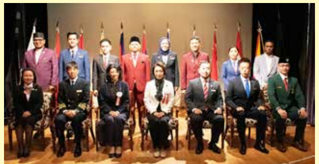
Group Photo with Ms. Junko MIHARA, Minister of State for Youth Affairs of the Cabinet Office and National Leaders