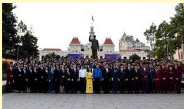
Flower offering ceremony at President Ho Chi Minh Monument (14th November)