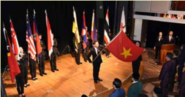
Flag Hoisting Ceremony by Viet Nam (14th November)