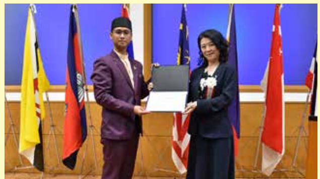
Youth Leader of Brunei Darussalam receives the certificate