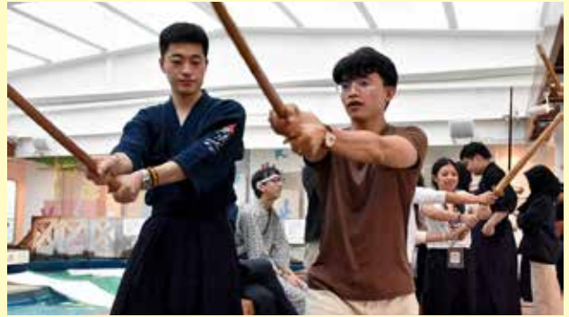
[S22] "Spirit of Japanese DOU" by Japan