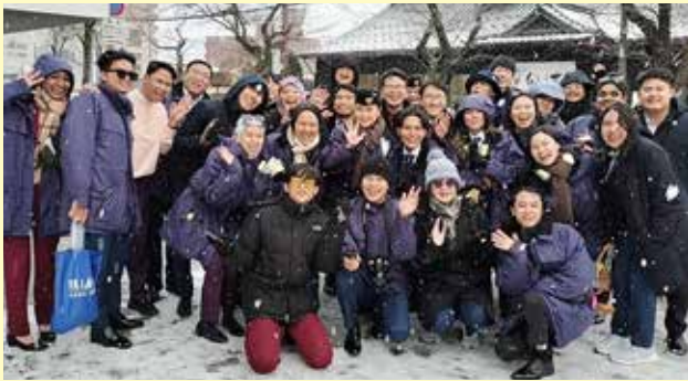
Excited and enjoying snow together (6th December)