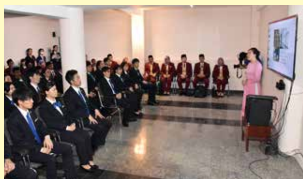
Participating Youth listening to the explanation about Independence Palace (14th November)