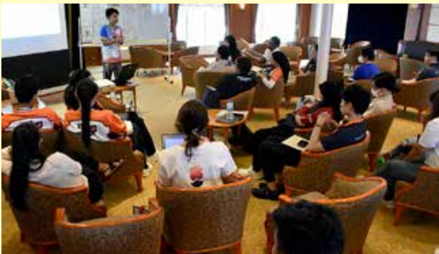
Exchange opinions on each type of well-being and presented similarities and unique definitions (DG5 Good Health and Well-being Group)