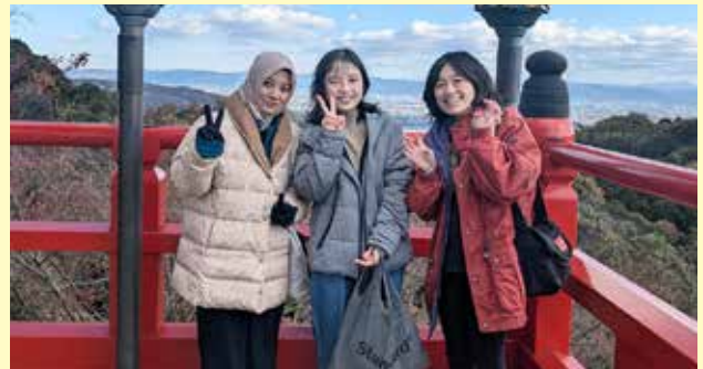
Visit various places with homestay parents (7th December)