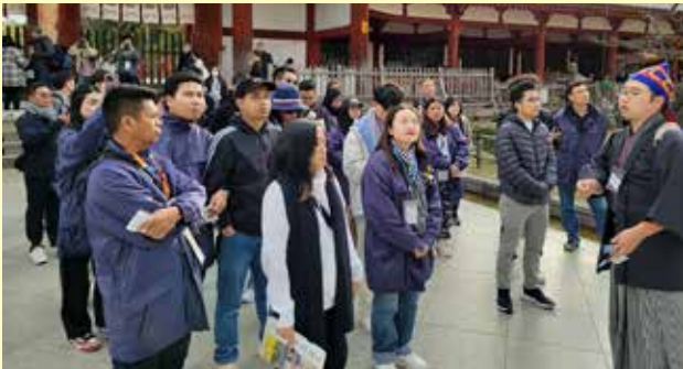
Visit Todaiji Temple with Local Youth (6th December)