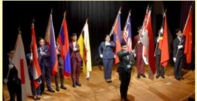
Flag Hoisting Ceremony by Indonesia (21st November)