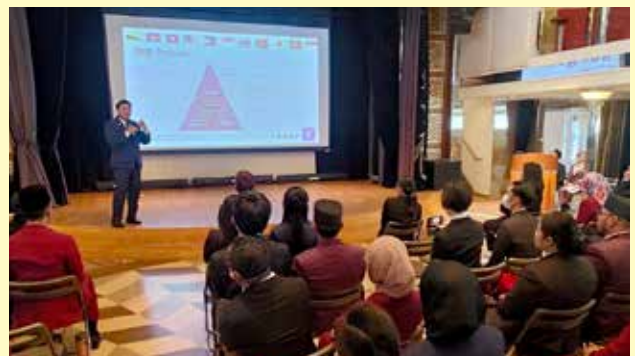
Presenting the discussion result (DG4 Disaster Risk Reduction and Recovery Group)