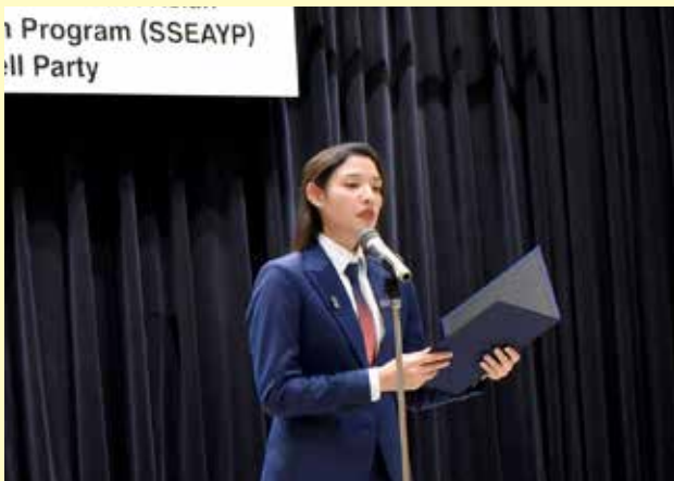
Youth Leader of Thailand makes a speech