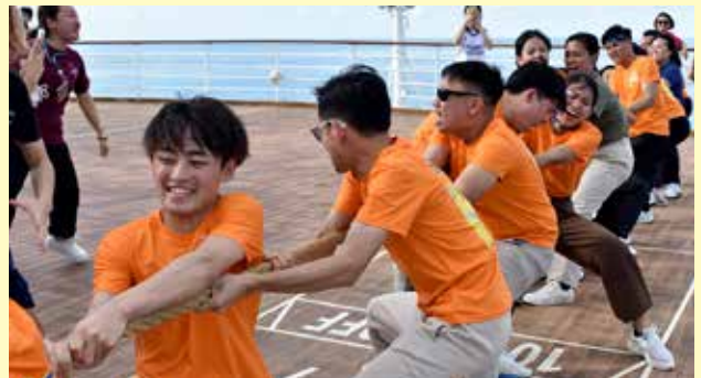
SG Sport competition (20th November)