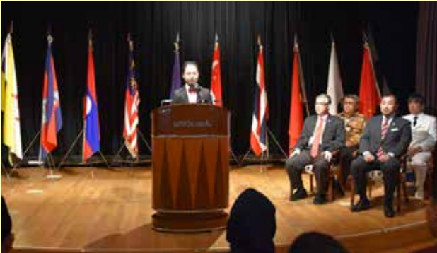
Youth Leader of Lao P.D.R. makes a speech at Welcome Ceremony (21st November)