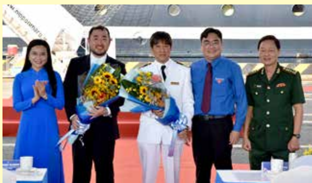
Warm welcome from the Central Committee of the Ho Chi Minh Communist Union (14th November)