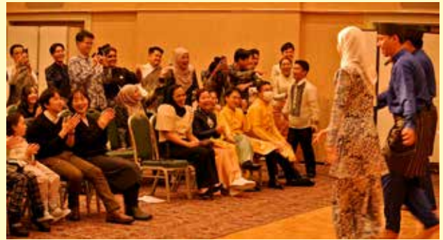
Participating Youth presenting a performance at Homestay Matching (7th December)