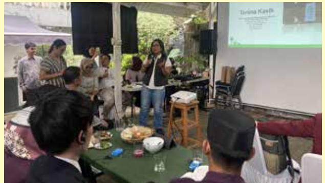
Participating Youth visit The Indonesian Forum for Environment (DG3 Global Environment and Climate Change Group) (22nd November)