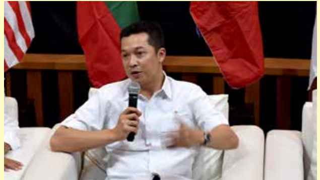
Mr. Taufik Hidayat, Deputy Minister of Youth and Sports, makes a speech at a Theater room, Ministry of Youth and Sports (21st November)