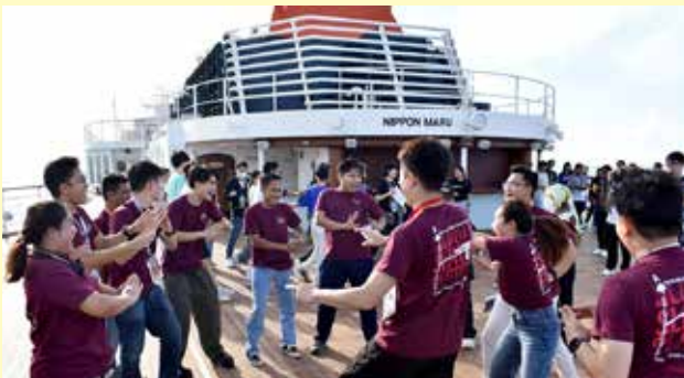
Warming-up before the game (12th November)