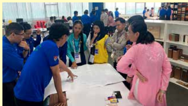
Participating Youth visit Ton Duc Thang University (DG3 Global Environment and Climate Change Group) (15th November)