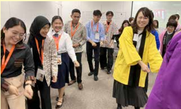
Experiencing "Bon Odori" which is good impact to mental health as well as physical health (DG5 Good Health and Well-being Group)