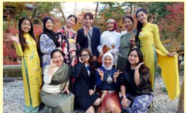
Walk around Kokura Castle Garden with local youth (6th December)