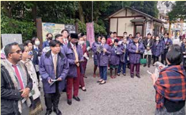
Walking through Suizenji Jojuen Garden with a local guide (6th December)