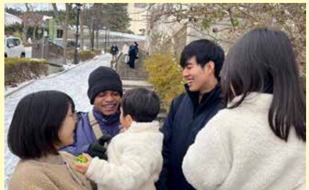
Participating Youth promising to be reunited with their host families (9th December)