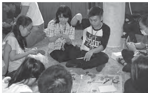
Club Activity (Lao P.D.R.)

Tea ceremony, Okinawa's traditional dance Eisa, Japanese calligraphy