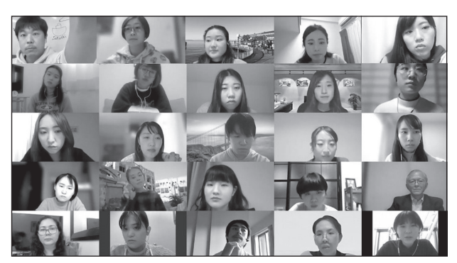
The Pre-Program Training Session