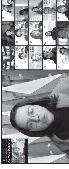
Poland: Volunteering organizations across Poland

* ID of PYs are listed in the column of Organizers