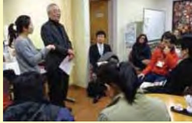
Itabashi-ward Community Space Network Participating youth visit four community cafes and listen to why people started operating cafes in order to activate local community at Takashimadaira residential complex in Tokyo. (Community Development Course)