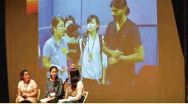
Participating youth elaborate the connections between the ports of call activities and course learnings. (Education Course)