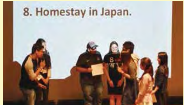
Participating youth play skits to demonstrate their culture shocks at the last seminar.