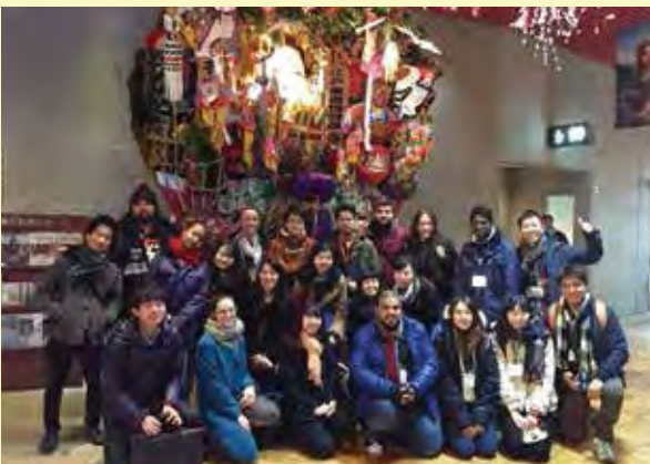
Participating youth visit the Edo Tokyo Museum.