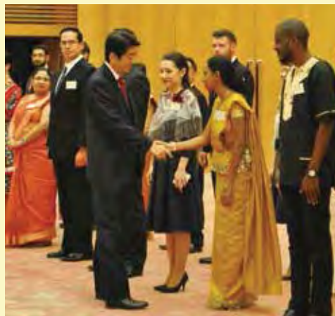
Courtesy Call on the Prime Minister Shinzo Abe