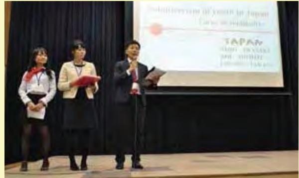
Japanese participating youth present about the voluntary activities, focusing on their continuation strategy.