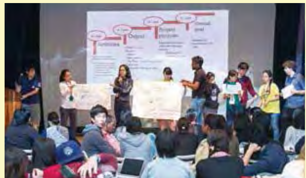
Participating youth share their projects and receive feedbacks.