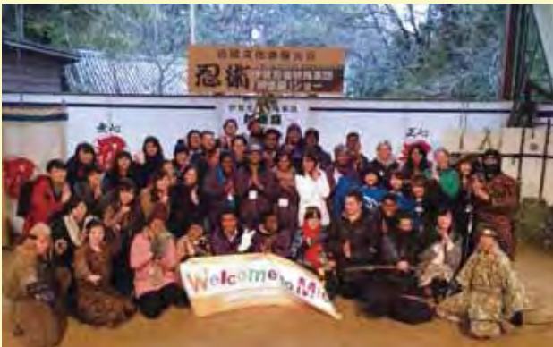
Participating youth enjoy Ninja show and learn about Ninja in Mie Prefecture.