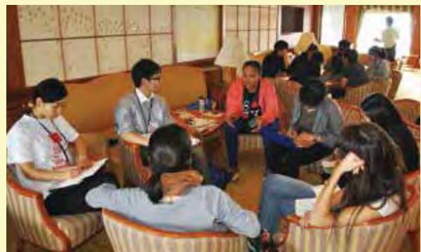
Participating youth learn from the initiatives taken in each country, how to make the best use of the community resources to reduce the negative impact on the earth. (Environment Course)