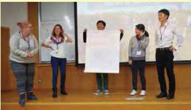
Based on some case studies, participating youth create projects that aim to seek for the solutions. (Community Development Course)