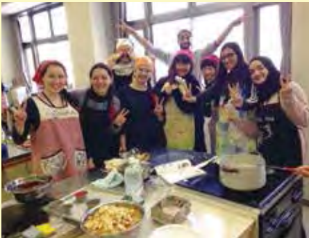
Participating youth join cooking class at Yamanashi Eiwa Junior & Senior High School in Yamanashi Prefecture.