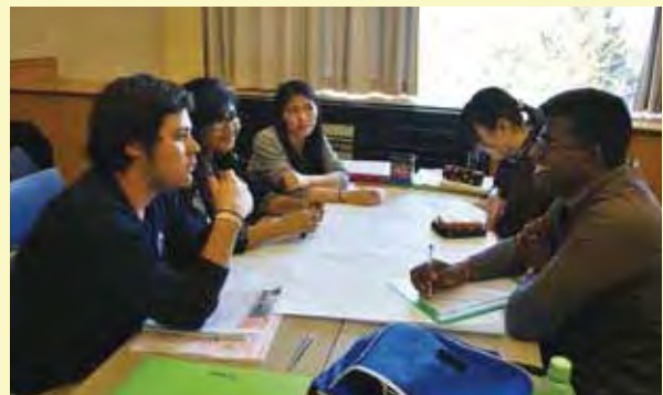
Participating youth share information about natural disasters that they face in their communities, and compare characteristics of their impacts. (Disaster Risk Reduction Course)