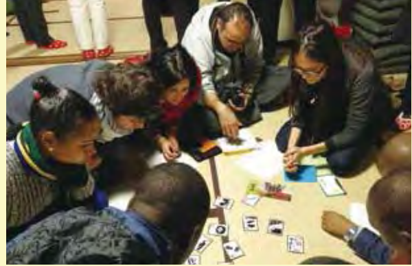
Participating youth experience Japanese culture at Nansho-so in Iwate Prefecture.