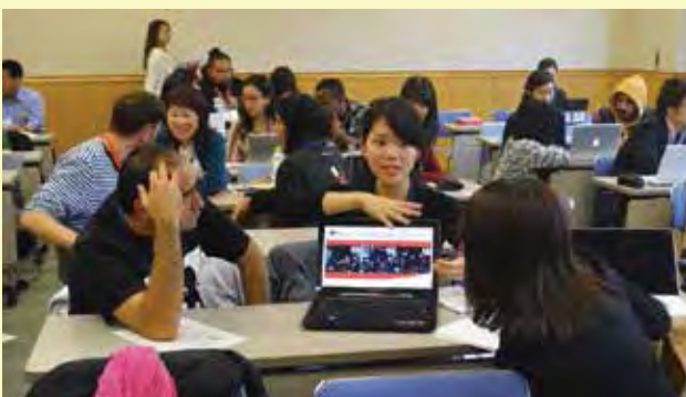
Participating youth share the commercial advertisement materials they have and develop their awareness on the issues surrounding media. (Information and Media Course)