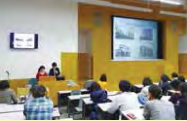
"Neighbors Next U26 Project" HITOTOWA Inc. Participating youth learn about the situation, problems and resolutions of Japanese family and residence issues. (Community Development Course)