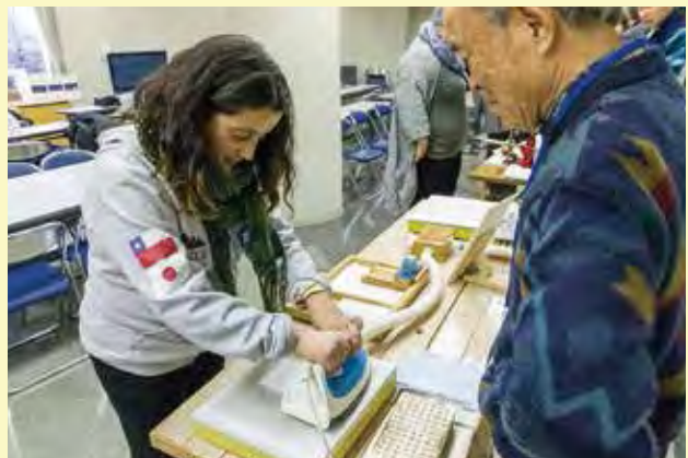
Participating youth experience paper pressing at the Paper Museum.