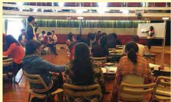
Under the theme of "start-up business for the social contribution," participating youth compete in the business planning contest. (Youth Entrepreneurship Course)