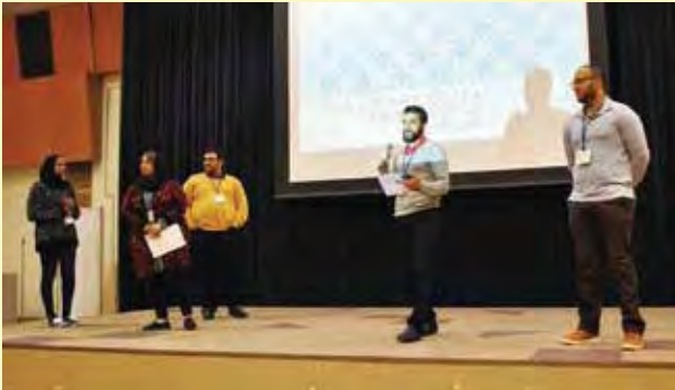
Bahraini participating youth introduce 4 different voluntary programs which they were involved in.