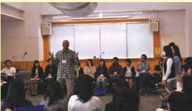
Envisioning educational leaders they want to become, participating youth set the goal they wish to achieve through the Course Discussion. (Education Course)