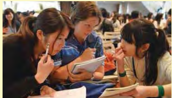
Participating youth discuss about how leaders should act to empower others.