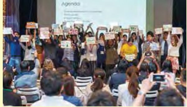
After sharing their course learning, each member makes a declaration for the post-program activities. (Environment Course)